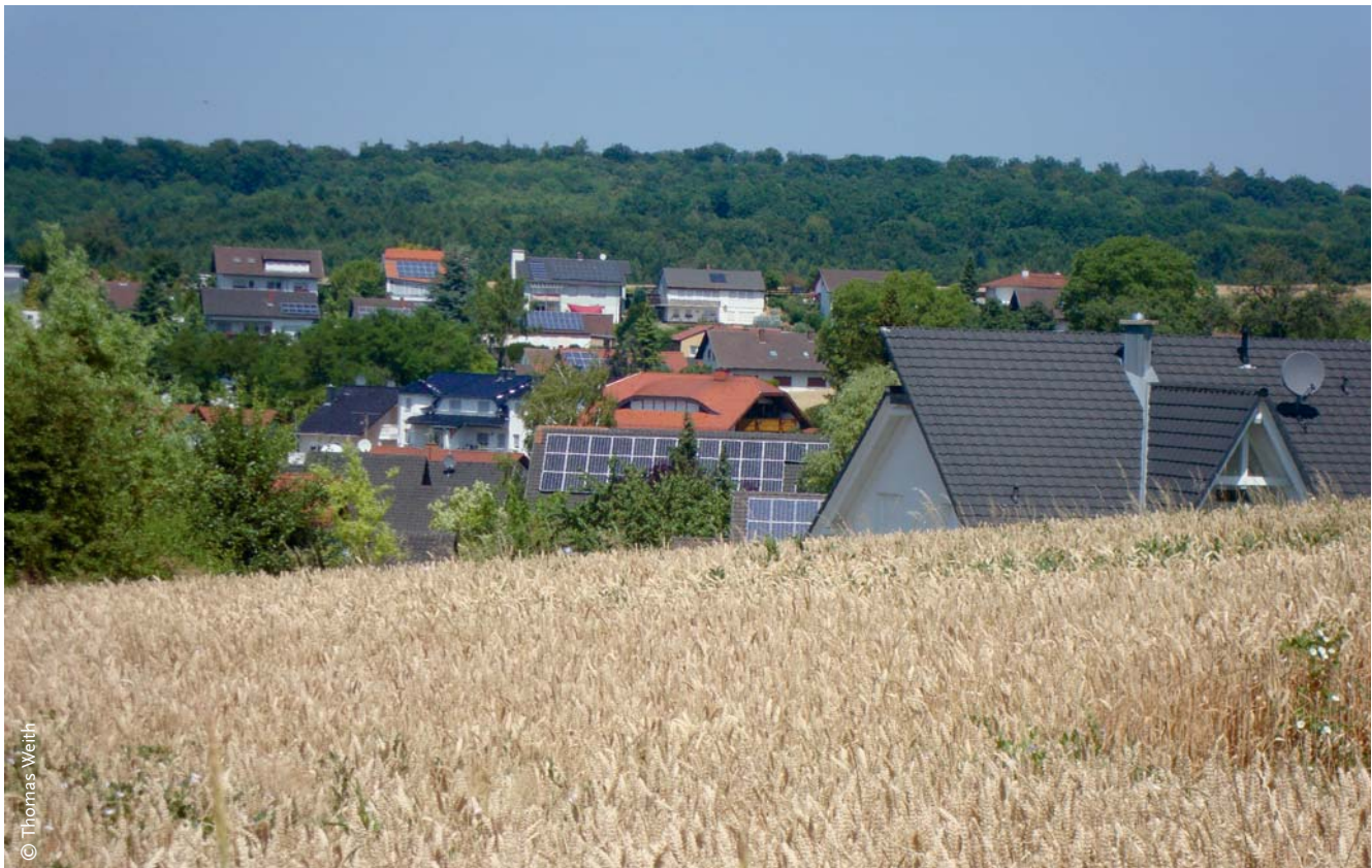
FIGURE 1: Sustainable land management: finding solutions for conflicts of interest (e.g., between housing and agriculture).