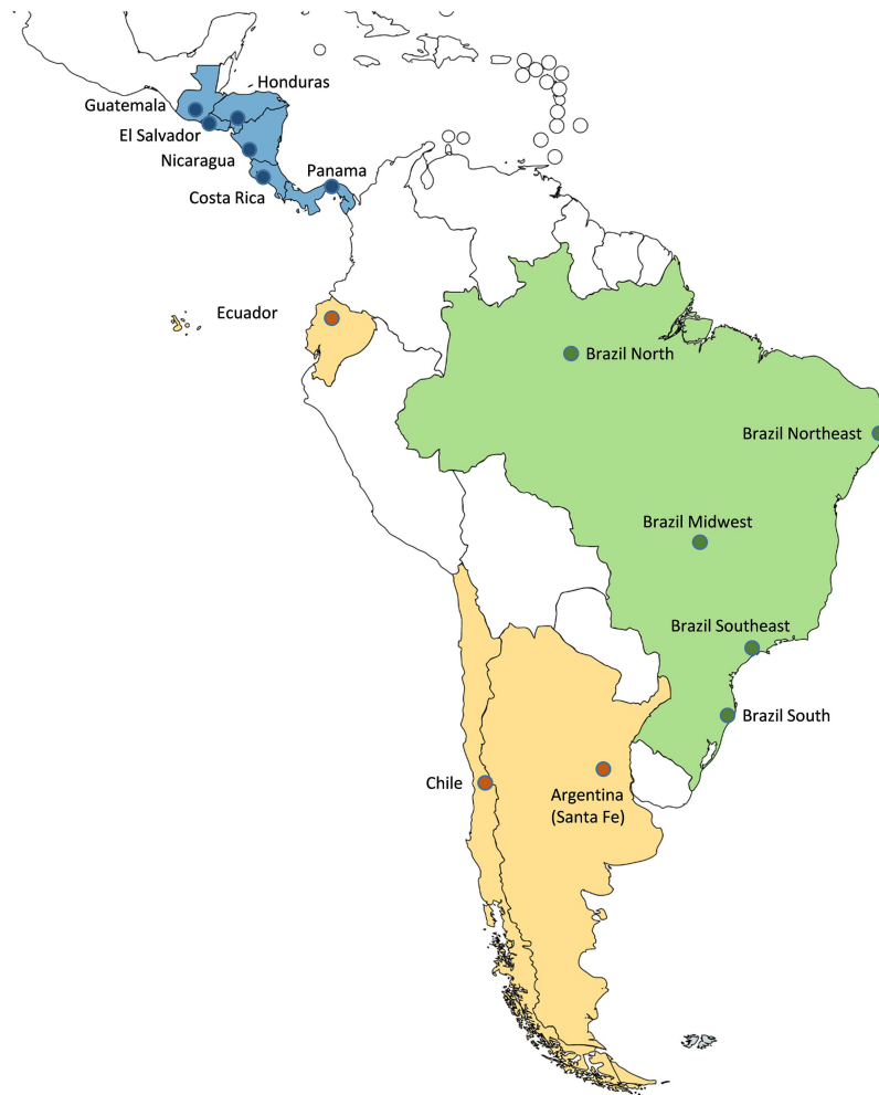
Fig 1. Countries and sub-national regions that were included in the analysis. The Global Influenza B Study, Latin-American countries, 2003–2014. Dark Blue: Central America. Light Blue: Brazil. Yellow: remaining sites in South America.

https://doi.org/10.1371/journal.pone.0174592.g001