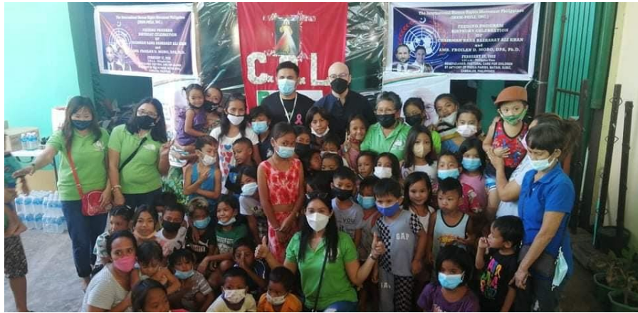
Figure 1. Shows the conducted feeding program sponsored by the International Human Rights Movement (IHRM) Philippines.

experts in the diverse areas of food systems to work together more effectively under the umbrella of nation or union is also possible, (Hussein, 2021).