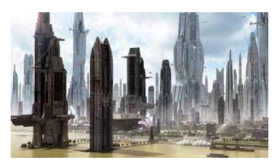
Fig.6: showing the architectural style of the urban futuristic cities in the movie.