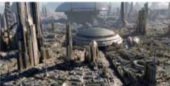
Fig.1a: Star Wars (1977) Fig. 1b Star Wars: Episode III - Revenge of the Sith (2005)

Whether in movie or architecture, the use of narration may provide a framework for the reality experienced as the spectator passes through space. It foreshadows that our society is experiencing several rapid revolutions and changes, which arise from the massive growth of technology and capitalism, and the film industry plays an important role in portraying those changes, presenting the future with numerous science and fiction films which are a warning for change. It will seek to discuss both the wealth of techniques for using the moving picture for the constructed world and the determining impact of architecture and urban spaces as performers. Situations and activities, places and thoughts, are not outside. They describe each other and become a real experience. This duality is probably more obviously experienced from the world of cinema than anywhere else (Harvey, 2010).