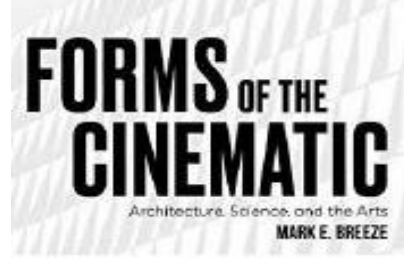
Fig.3: Forms of the cinematic Source by author Mark B., 2021