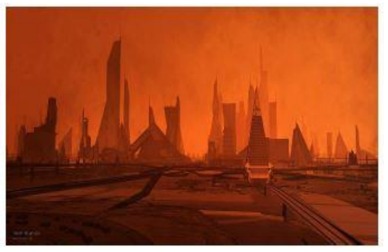
Fig.7: Showing the architectural style of the urban new cities in the movie.

The recent so-called gulf futurism movement describes a very specific architectural brand and urban design that powers the Middle East. Dubai, the future dystopian town. This new wave of large oil design, inspired by video spiel and Hollywood cinema, is dominated by several millionaires who develop amazing futuristic landscape. Dubai is one of the key designers behind Blade Runner and is one of the hot beds of futuristic Gulf Architecture. Life is the impersonation of art, and then art is the imitation of life. The evolution of our cities during the last century can explicitly see this eternal back and forth. Perhaps at present the most striking is a tendency to be influenced explicitly by the visions of science fiction that are deeply entrenched in dystopian perspectives for some of these great futurist cities.