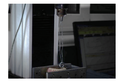
Figure (14) — Universal Testing Machine recording dislodgement forces

upward at 50 mm/min crosshead speed. Linear dislodgement slide was carried out, perpendicular to the occlusal plane, and the forces were recorded using a compatible computer software (Bluehill Universal, Instron, England).