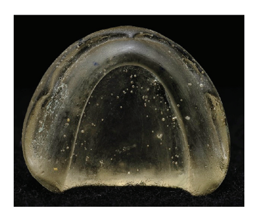
Figure (1) — Clear Epoxy Class 1 Edentulous Model

Scanning of the edentulous template was done by the aid of an intraoral scanner (Medit i700) to obtain an accurate 3D render of the template.