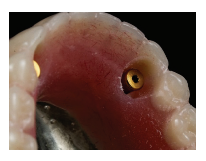
Figure (11) — Prepared denture for Pick-up