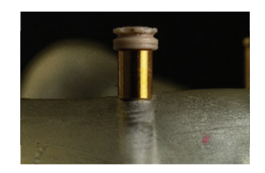
Figure (4) — PEEK retentive cap fitted on the Male attachment

In order to have an accurate comparison between the PEEK and the Nylon retentive caps, an exact replica of the PEEK retentive cap was made.