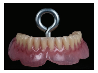
Figure (13) — Finished Denture with steel hook

A round steel hook was attached the to the denture tongue space at the midline, centered between the two attachments according to the geometric centers of the attachments, to be used during the measurements of the retention.