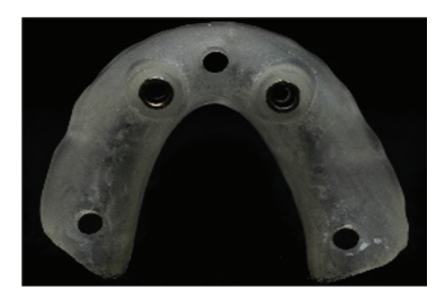
Figure (2) — Guide for Implant Placement

A fully limiting guide was designed using a computer software (RealGuide, 3diemme, Italy), with implant drilling sites 23 mm apart crossing the midline. Two 3.8mm in diameter x 10.5mm in length implants (BioHorizons, Tapered Internal) were used and the sleeves and guide fabrication were done accordingly. Implant drilling was done sequentially according to the manufacturer's instructions, and implant placement was finally done with a torque wrench adjusted to 30Ncm, and a final coat of epoxy resin was put on the surface of the implant fixtures to ensure proper bonding of the implant to the template.