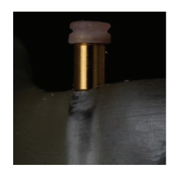
Figure (9) — Custom Nylon Cap over Locator

The holes corresponding to the attachment was widened, a pick-up was made for the different caps using cold cure acrylic resin (Acrostone). The rubber spacer was first inserted under the caps, and the remainder of the attachment was sealed using Teflon. Excess acrylic from the pick-up was removed and the surfaces were finished and polished.