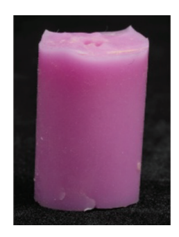
Figure (5) — Silicone impression of male part

Addition curing silicon-based duplicating material (Replisil 22N) impression was taken for the metal male part of the LOCATOR and poured with Extra Hard dental stone Type IV(Zhermack)to produce a positive reproduction of the male part of the attachment system.