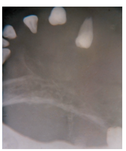
Fig. 2: Occlusal radiograph showing labially displaced anterior teeth giving floating teeth appearance.