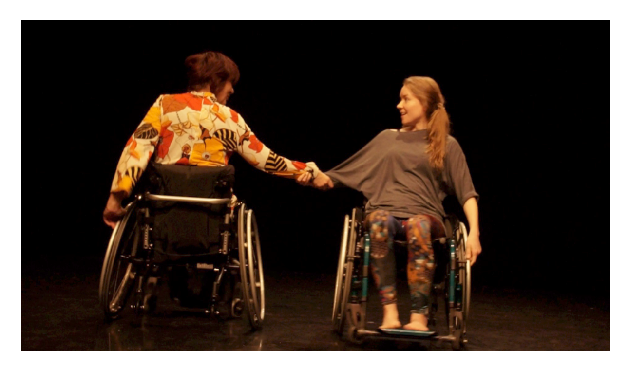
Figure 1: Still image from Stage Lab 1's video

In November 2016, six performers with disabilities from the Compagnia Teatro DanzAbile (Lugano, Switzerland) and eight Master's students in Physical Theatre at Accademia Teatro Dimitri (Verscio, Switzerland) met in a two-week physical theatre workshop. This workshop