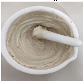
Figure 3: Herbal face cream

OBJECTIVE: The objective of this research work was to develop the cream which does not cause any side effects or adverse reactions. The cream also acts as a skin tone in day-to-day life by giving even skin tone. It also possesses vitamin E which provided required nourishing to the skin.