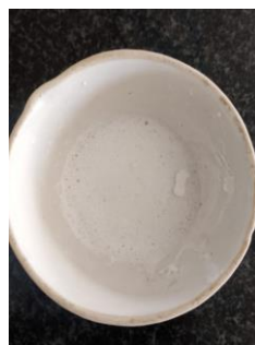
Figure 2: Preparation oil phase