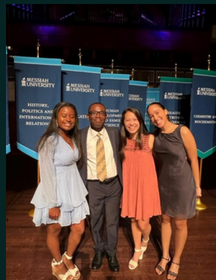
Seniors receive a pin to wear on their graduation robe.