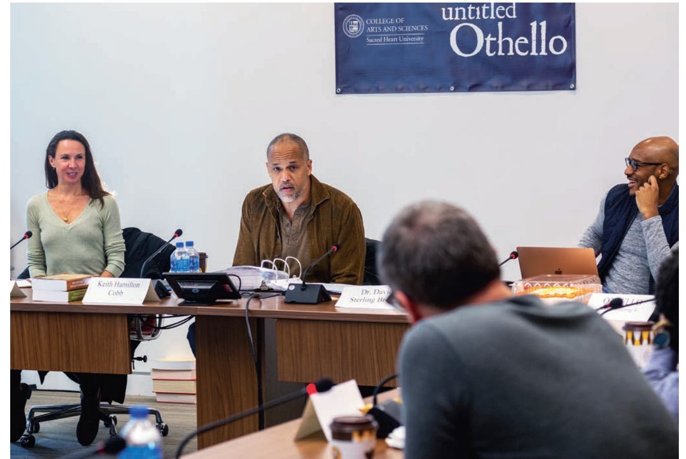
KEITH HAMILTON COBB (ABOVE, CENTER) DURING THE UNTITLED OTHELLO PROJECT'S TWO-WEEK RESIDENCY ON CAMPUS. THE EVENT WAS LIVESTREAMED AND SHARED WITH UNIVERSITIES ACROSS THE COUNTRY.

Finding the Othello that could be there—indeed, the one some might say should be there—is no small task, but