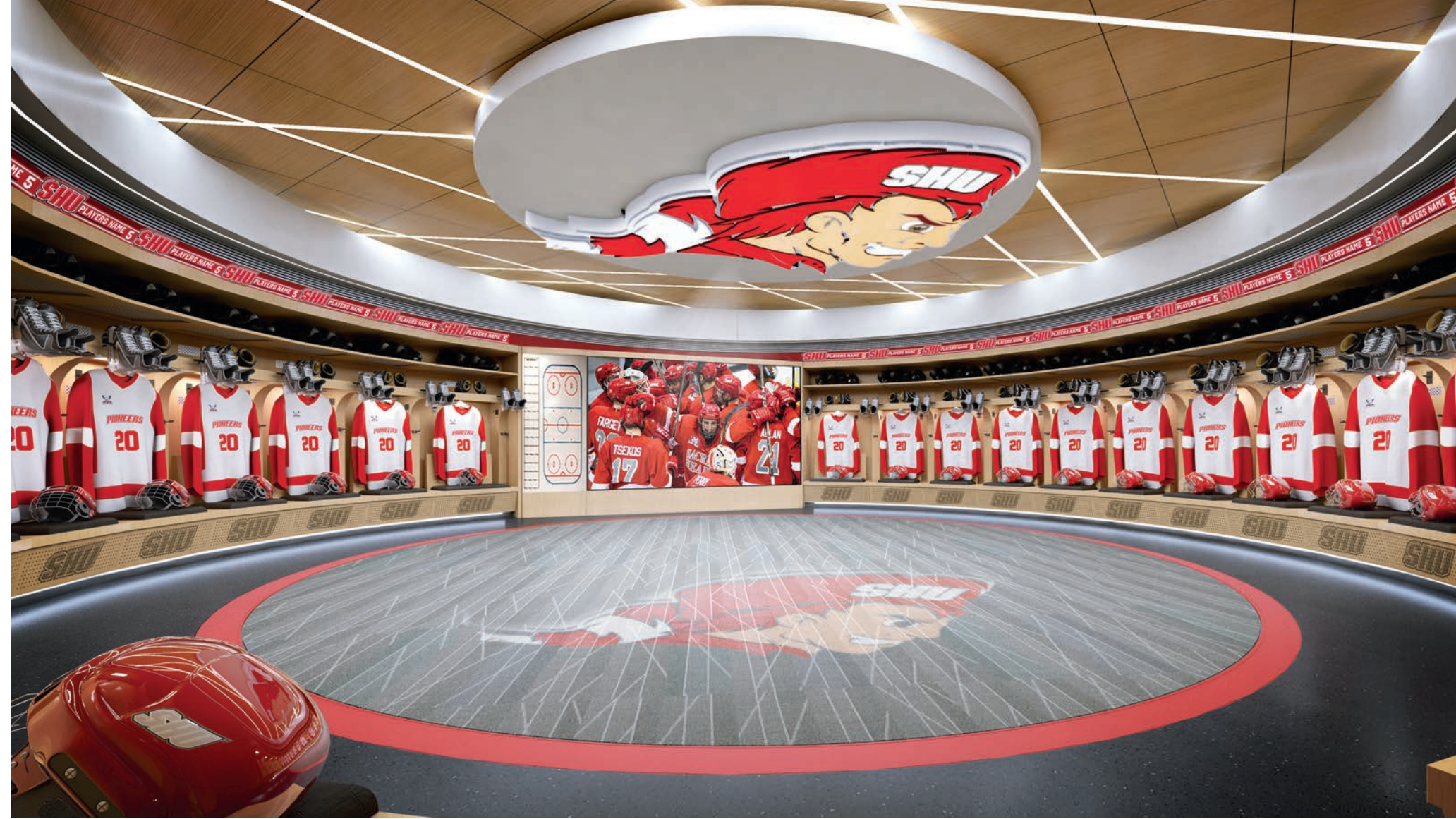
THE PIONEERS (#PIOS) ARE AS DEEP IN TALENT AS THEY ARE IN FAN LOVE AND SUPPORT. THE NEW MARTIRE FAMILY ARENA WILL BE A HOME FOR BOTH.