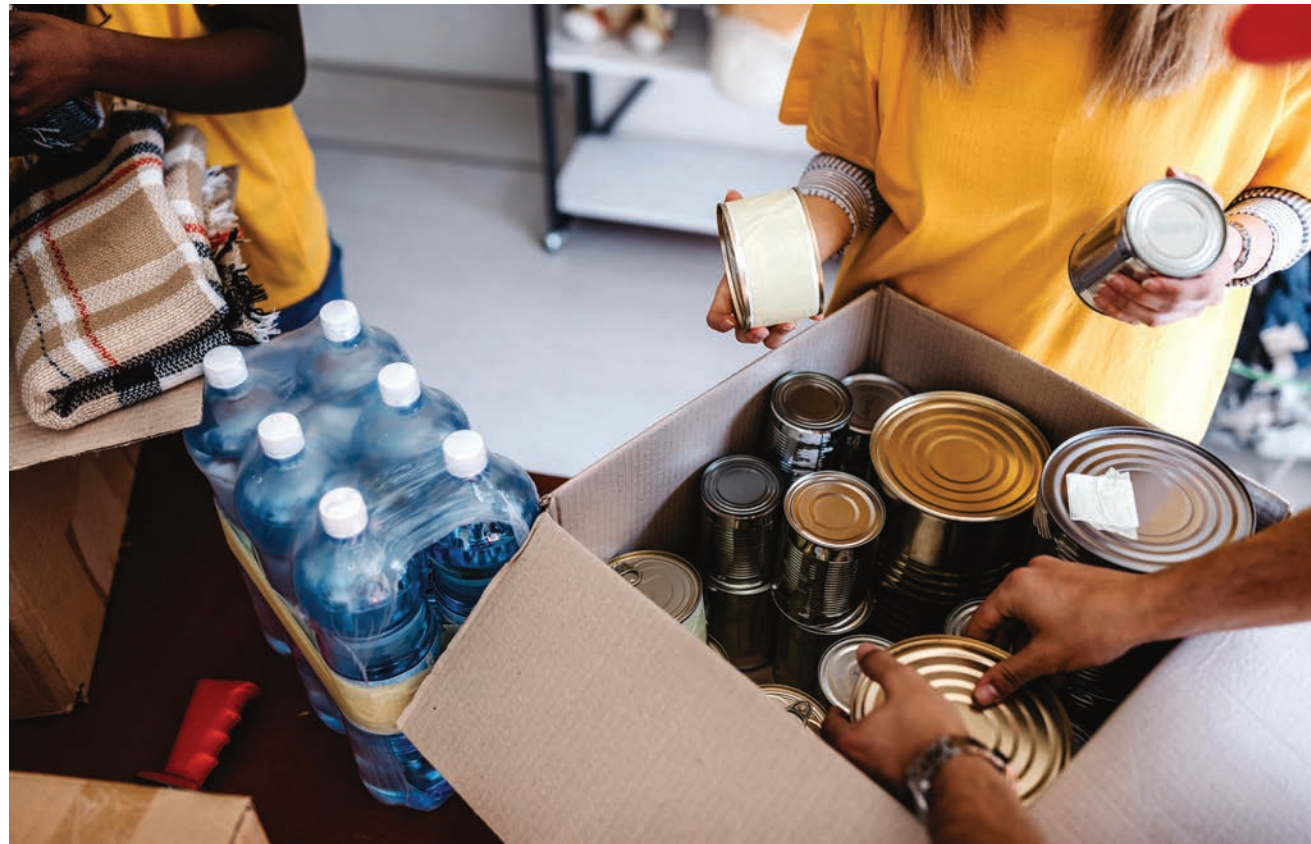
THE SORORITIES AND FRATERNITIES AT SHU ARE MORE ABOUT PACKING CASES THAN CRACKING THEM OPEN...