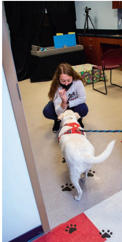
THE CANINE COGNITION LAB AT SHU IS THE FIRST IN THE COUNTRY TO ENGAGE UNDERGRADUATE STUDENTS AS RESEARCH ASSISTANTS.