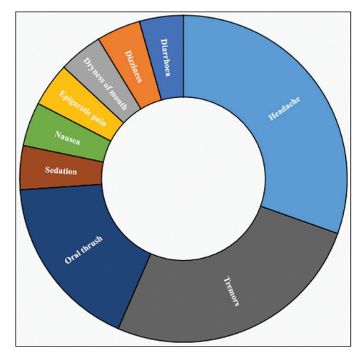
Figure 1: Sunburst diagram showing the various adverse drug reactions

The objective of this study is to assess the ADRs with management of anti-asthmatic medications in adults. In the present study, prescriptions of 340 adult patients were studied. On analysis of the prescriptions, it was found that asthma was reported more in male patients (60.59%) as compared to females (39.41%). The male female ratio was 1.54:1. However, in a study conducted by Agrawal et al. [7] found that female gender has consistently been associated with higher prevalence of asthma in adults. A total of 15 ADRs were reported in a study [8] 13 out of 200 asthmatic patients. Among the 13 patients reported with ADRs, 5 (38.5%) were male and 8 (61.5%) patients were female. Maximum percentage of ADRs (two in 15 prescriptions, 13.3%) observed with montelukast, followed by beclomethasone (one in 12 prescriptions. 8.3%), salbutamol (six in 109 prescriptions, 5.5%), and ipratropium (three in 63 prescriptions, 4.8%). In our study, also higher numbers of ADRs were observed in female patients as compared to male patients. It might be attributed to females being more sensitive to the