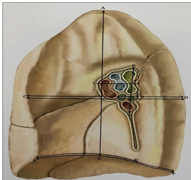
Fig. 2: Showing different parameters on medial surface.

Table 1 shows the different colors of the lungs as observed in the present study. It is evident that majority of lungs depicted mottling in the form of black, brown or grey in color in 38%, 28%, and 26% of the specimens, respectively. A complete grey, brown, or brownish black color was seen in 2% lungs each. In one lung yellow mottling was seen which could be because of fat deposition.