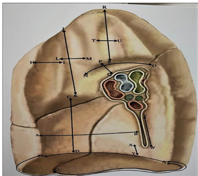
Fig. 3: Showing different parameters on medial surface.

of lung. KL=Vertical diameter of Hilum of lung