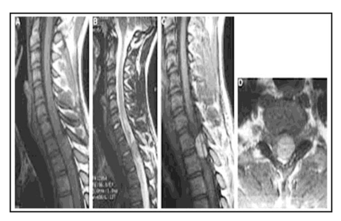
Figure 1: MRI cervicodorsal spine sagittal view T1, T2 weighted & contrast (A, B & C respectively) & axial view(D) showing meningioma at D1-2 level (Images included with the consent of the patient).

All patients were investigated with pre-op MRI. Follow-up of patients was done for clinical improvement & radiology at 3 months, 6 months & 1 year.