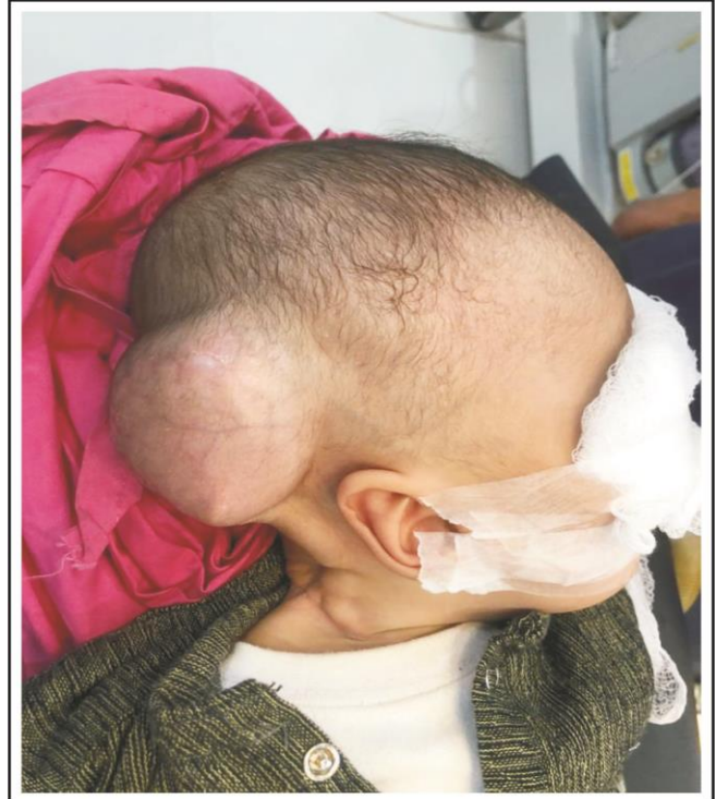
Figure 5: Baby with upper-end shunt blockage and subgaleal CSF collection (used with patient's family's permission).