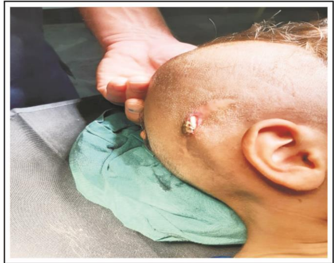
Figure 1: A child with the exposed upper end of VP shunt (used with patient's family's permission).