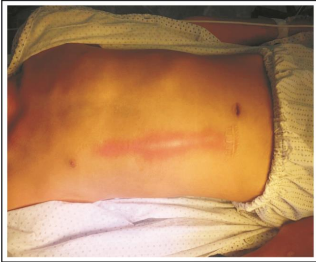
Figure 3: Lower end VP shunt infection (used with patient's family's permission).