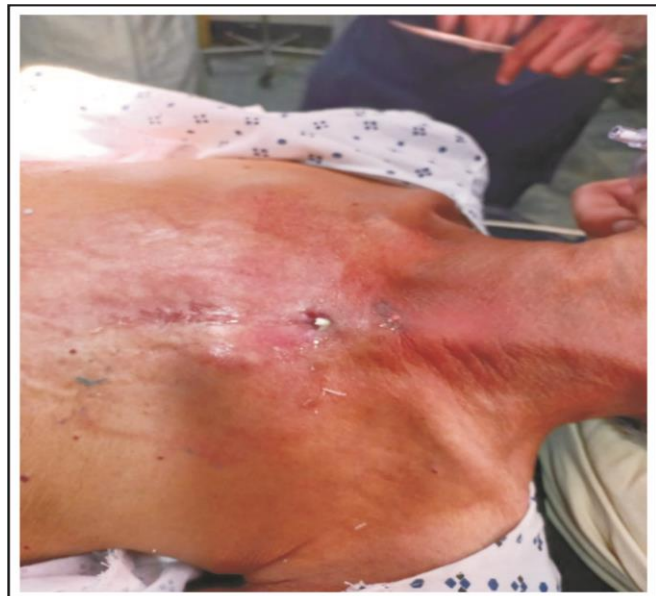
Figure 2: Exposed shunt through the skin due to infection (used with patient's family's permission).