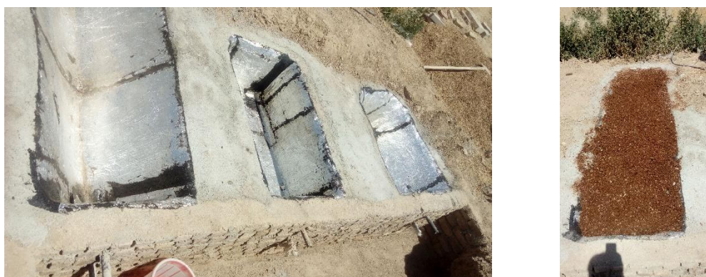
Figure 1-Denitrification beds before and after filling

After creating beds, in order to prevent the seepage, inside the beds covered with concrete and then it was waterproofing. Then these beds were filled with wood chips of beech tree. The volume of wood chips used in the three denitrification bed was the same. After filling all the beds from the wood chips of beech tree, it was covered with plastics. Figure 1 shows the denitrification beds before filling and afterwards. Two tubes of 1inch diameter were placed at a depth of 25 and 50 cm from the bottom of the bed as an outlet.