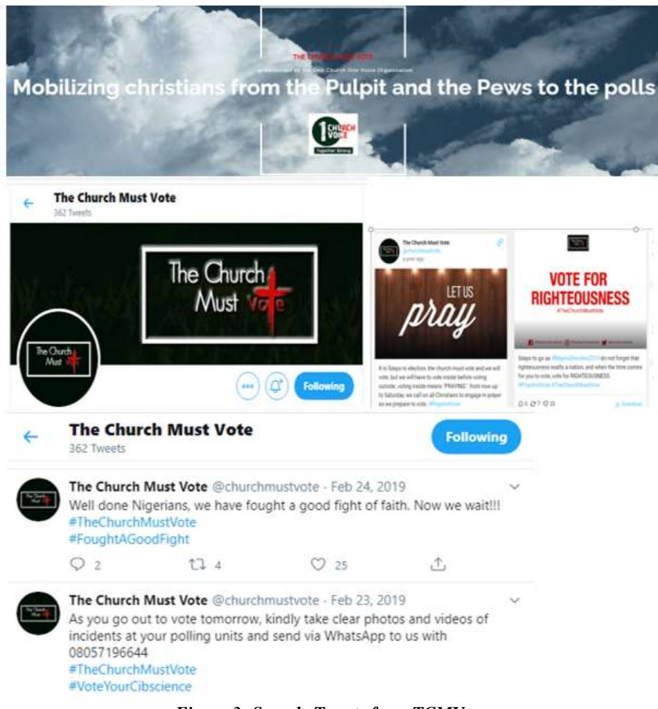
Figure 3: Sample Tweets from TCMV

Data further show that social media engagement played a powerful role in not only educating the people but also mobilized them to collect their PVC. This answers the research question one. It also