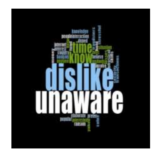
Figure 4. Screenshot of thematic analysis showing reasons for non-use of IB and the word cloud representation.

(Respondent 19, female, non-IB user, Ijero LGA).