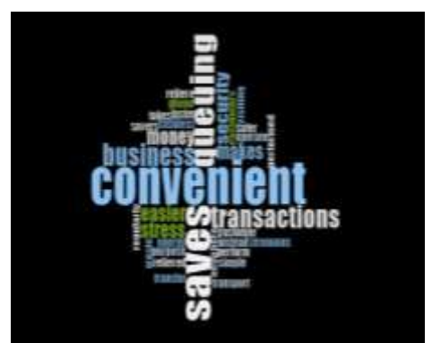
Figure 3: Screenshot of thematic analysis showing reasons for IB usage and the word cloud representation

The study can identify some reasons that made the older adults use IB, which could be summarised positive as attitude, ease of access and use, perception of usefulness, convenience, cost-saving, subjective norms or social influence, self-efficacy, as well as security. The interview responses also identify benefits such as convenience, time-saving, cashless transactions, ease of use, transparency, security, as well as any place and anytime banking, among others. These are in line with the findings of some previous studies such as Ahmed (2016), Appiah and Hayfron-Acquah (2016), Fadare (2016), Jham (2016), Jolly (2016), Lee (2009), Martins, Oliveira and Popovič (2014), Mukhtar (2015), Tarhini, El-Masri, Ali Serrano (2016). In Georgieva and (2018) study, the elders identified the need to be sociable, ease of use, safety, cheaper broadband, training, easy accessibility, easy user interface, and awareness higher as dominant using IB. determining factors for Arenas-Gaitán, Peral-Peral, RamÓn-JerÓnimo (2015) results also show that the perception of usefulness and ease of use are some of the reasons that