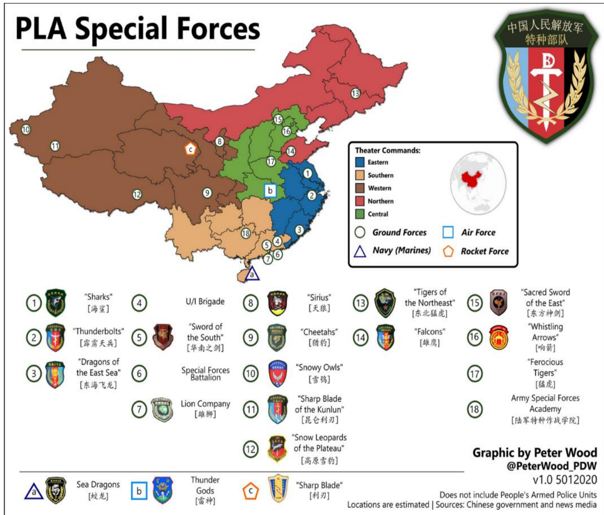
Exhibit 3. PLA Special Forces Units and Locations 35

seaboard in Hubei province. In addition, reconnaissance battalions assigned to the PLAA Group Armies and PLAN Marine Corps brigades are not explicitly designated as SOF but may also carry out special warfare missions in a Taiwan scenario. 34