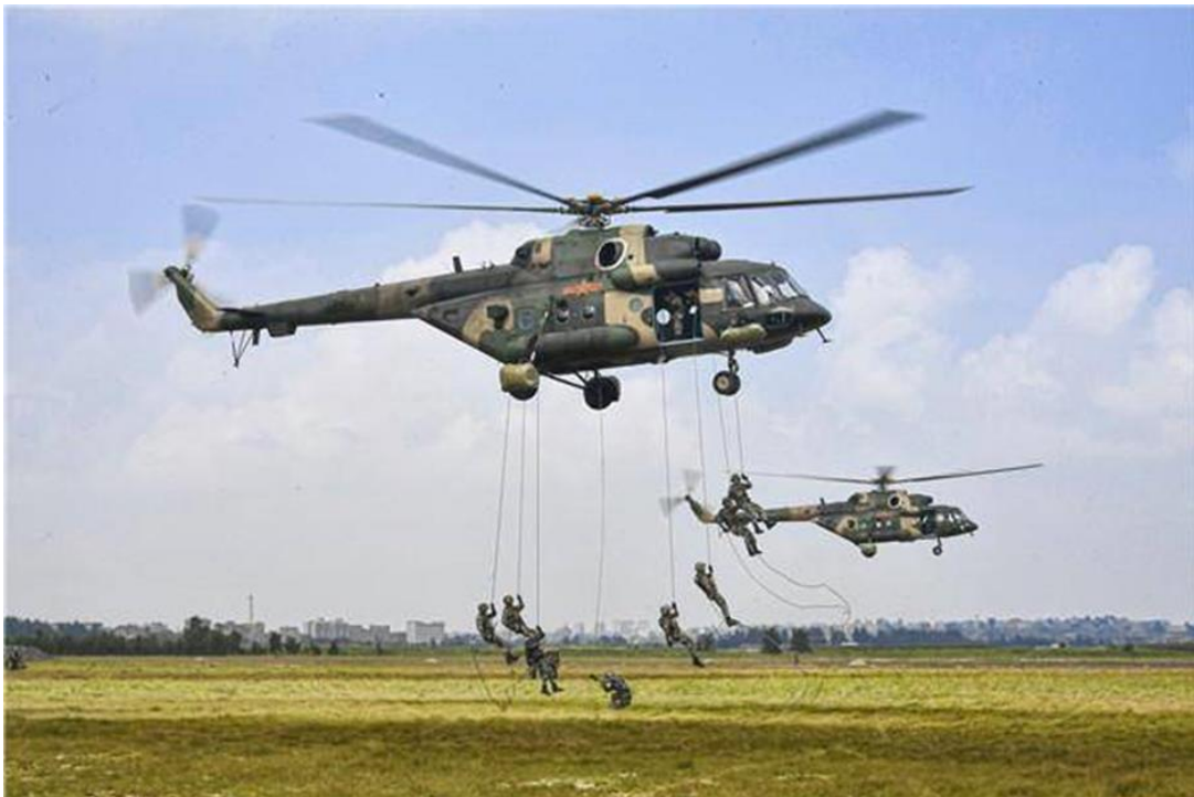
Exhibit 1. Members of the PLAA's "Flying Dragons of the East" conduct an air assault exercise. 5

The PLA has worked steadily over the last decade to ready SOF for an island landing scenario by refining doctrine, bolstering capabilities, and improving training. However, there are several variables that will influence these units' performance, including their technical proficiency and potential greater use of unmanned systems, which could replace humans in some roles but increase technical proficiency requirements; degree of jointness, including the need for larger and more frequent exercises with non-SOF units and continued reforms to joint command structures at and below the theater level; and the degree to which commanders try to micromanage SOF activities on the battlefield, which could lead to suboptimal results if those forces hesitate to act without explicit approval. The Taiwan and U.S. defense establishments should work to evaluate these challenges and weaknesses and determine whether plans for Taiwan's defense adequately consider PLA SOF.