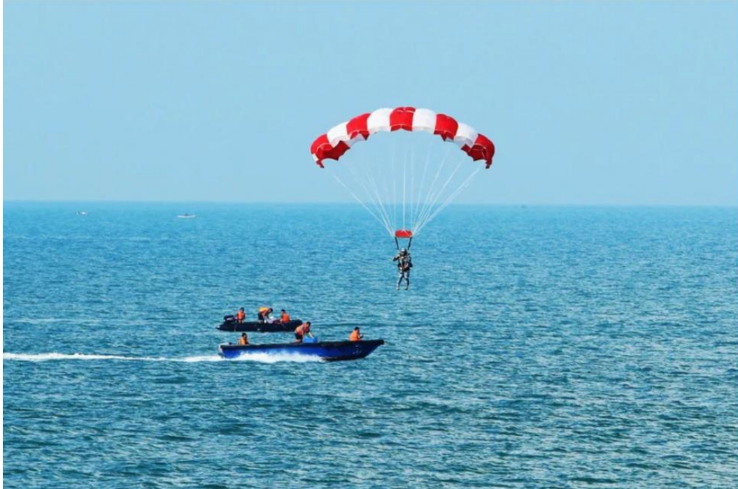
Exhibit 2. A member of the PLAAF “Thunder Gods” SOF brigade participates in a water-landing parachute drill. 30