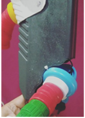
Figure 8. Revision of hand laying and join parts.