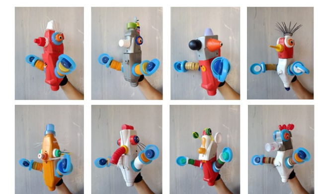
Figure 5. The initial prototype of Waboli V.2