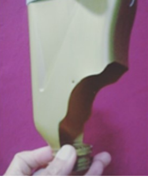
Figure 7. Revised hole section shape.