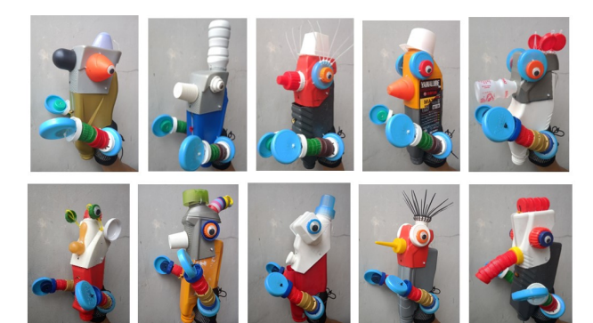
Figure 10. The final prototype of Waboli V.2.