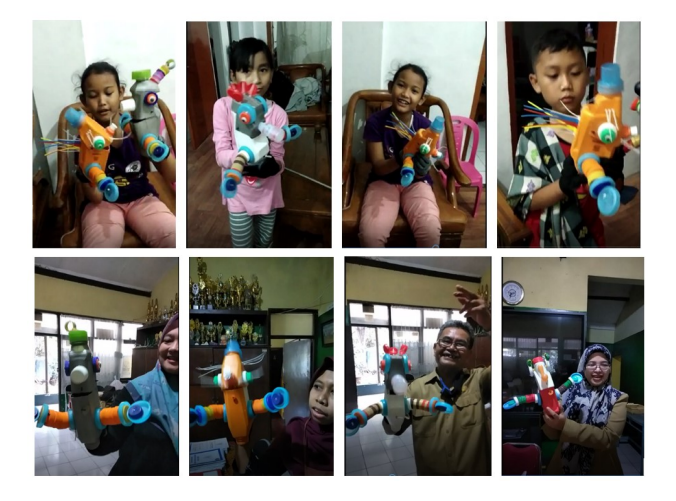
Figure 6. The initial prototype trial of Waboli V.2 conducted by the teachers and students

In addition to the foregoing, the teachers also stated that since the curriculum was replaced with the 2013 Curriculum, teachers could not teach specific language skills because the curriculum was thematic in their learning so that between one subject and other subjects were mixed or integrated. Meanwhile with regard to learning media, they stated that there was only one learning medium, namely instructional videos, while other non-digital media were only used in Grade I. This also causes teachers to be less free to develop the language skills or intelligence of their students.