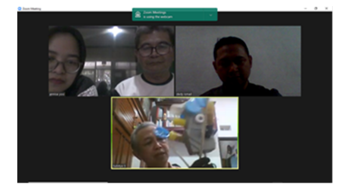
Figure 3. Focus Group Discussion with the teachers.