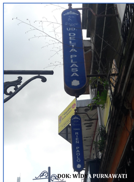
Fig. 10. Top-down shop name

Implementation of Bali governor regulation