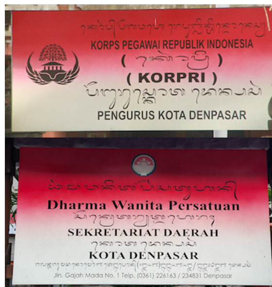
Fig. 11. Government office name

no. 80 of 2018 is clearly visible on the signboard of government offices name, as shown in figure (11).