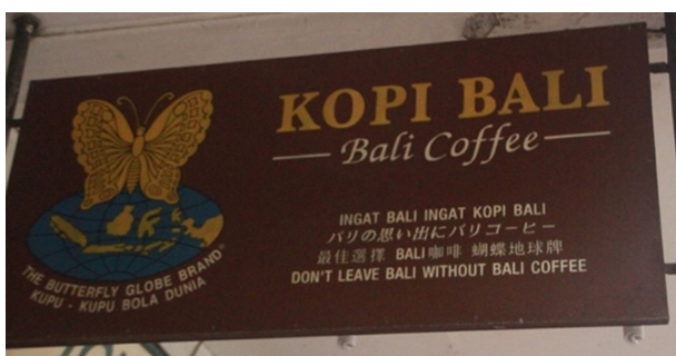
Fig. 9. Sign board written in 4 languages

Figure (9) is also an advertisement. The advert is for a coffee shop selling Balinese coffee under its own brand. Product types and product brands are translated into English only, but advertising slogans are also translated into Japanese and Chinese. On this signboard, the position of Indonesian is always above English. Japanese and Mandarin are placed between Indonesian and English. This ad is the only outdoor sign in four languages.