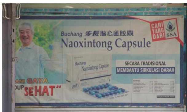
Fig. 8. Sign board written in 3 languages

Information in English only shows the name of the drug, while information in Chinese shows the benefits of the drug.