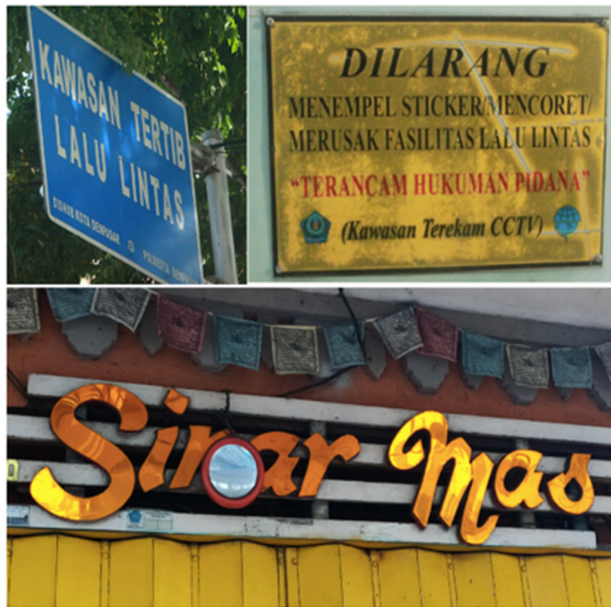
Fig. 5. Sign board written in Indonesian

Indonesian language is used in almost every outdoor sign in this area, in the form of business place names, government offices, banners, advertisements and others. This can be seen in Figure (5). Quantitatively, there are 174 outdoor signs that only use Indonesian.