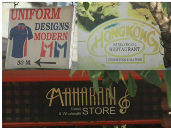
Fig. 6. Sign board written in English

Figure (6) shows several outdoor signs that only use English. There are 13 outdoor signs like this.