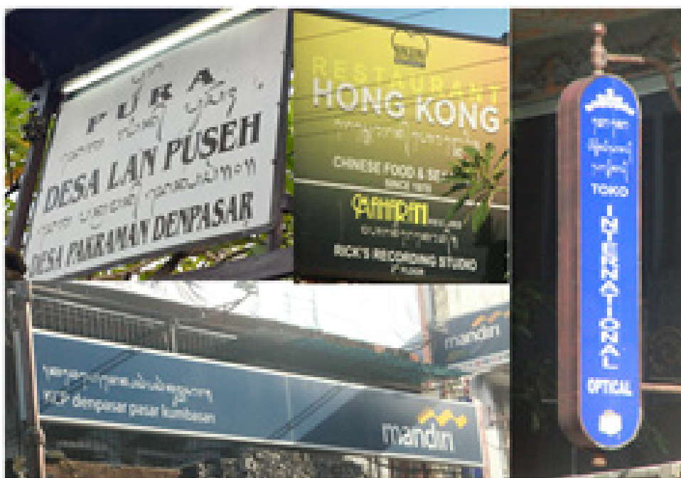
Fig. 12. Outdoor signboard written in Roman and Balinese Script