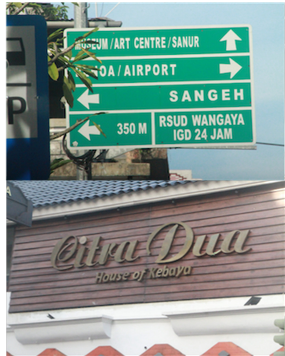
Fig. 7. Signboard written in Indonesian and English

On outdoor signs that use Indonesian and English there is no provision that Indonesian appears before English or vice versa. The use of Indonesian and English are complementary. The English used is not the result of a translation from the existing Indonesian language, but as additional information from what has not been conveyed in Indonesian. This can be seen in Figure 7.