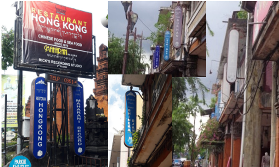
Fig. 3. Shop names on Jalan Gajah Mada

Balinese script. However, unfortunately not all the shop's names are still in good a condition. Some of them have their color changed into light blue or even just white. This condition can be seen in figure (3).