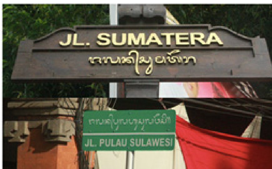
Fig. 13. Street signboard with Roman script and Balinese script

The outdoor signboard in figure (11) shows the consistency of the position of the Balinese script above the Roman script on the top-down outdoor signboard made by the government, although this can not be seen in the bottom-up outdoor signboard made by the private sector like the signboard for “Restaurang Hong Kong”. However, in several cases, the government also found inconsistencies in placing Roman script and Balinese characters as shown in Figure (13).