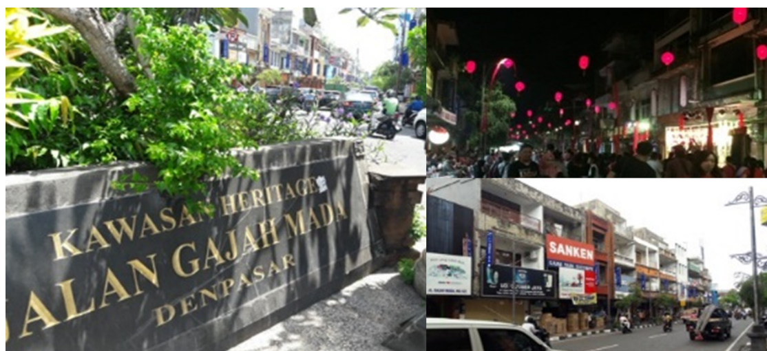
Fig. 2. Jalan Gajah Mada Heritage Area

This area has always been a trading center and a place for various ethnic groups to interact. This place is inhabited by Balinese, Javanese, Chinese, Arab, and Indian. Jalan Gajah Mada consists of a row of various shops which are mostly owned by Chinese descendants. Arab and Indian descendants mostly live in the area on the Sulawesi Street as cloth sellers. Balinese people are mostly traders in the Badung Market and Kumbasari Market areas. Among these various ethnicities, there are also Javanese descendants who are also sellers at Badung Market.