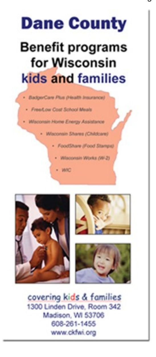
Figure 2. MAP Publication