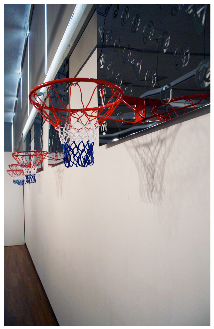
Tom Thumb, 2012, installation, Ewing Gallery of Art and Architecture