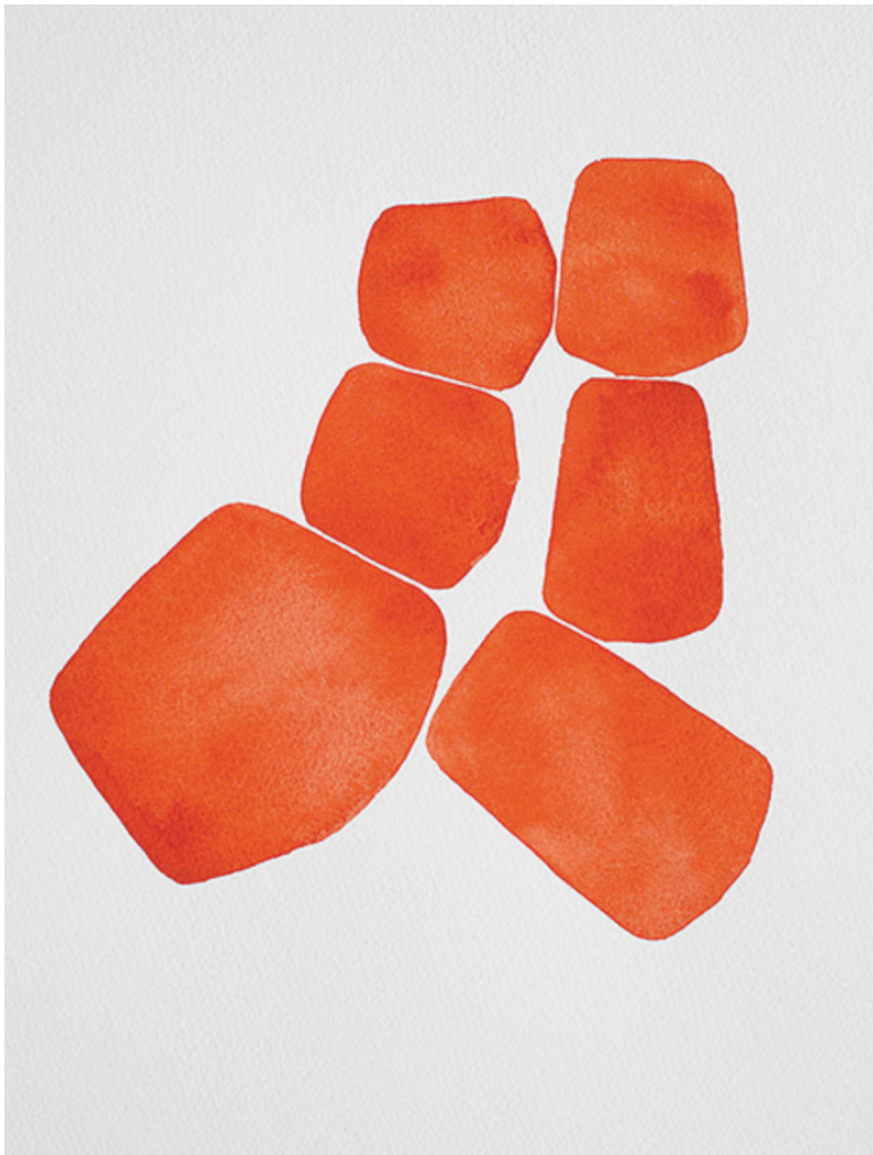
Fig. 11 Watercolour of Tobi-ishi, 2012 © Barber Osgerby