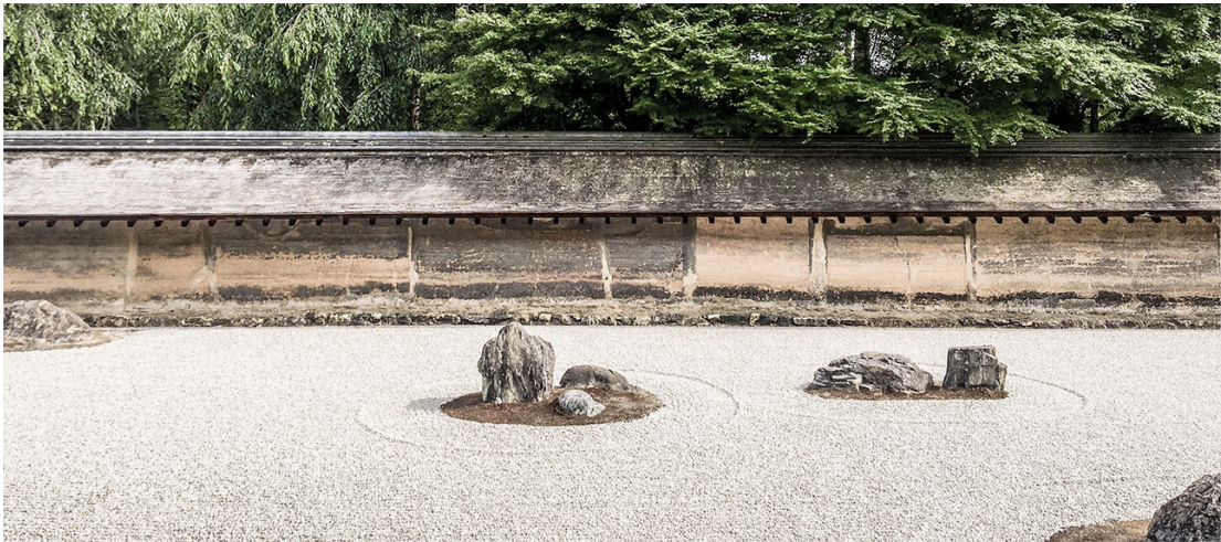
Fig. 3 Ryoan-ji, Kyoto, Japan