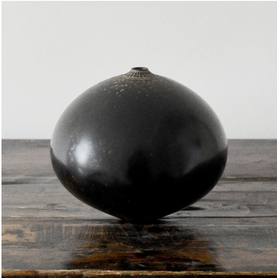
Fig. 19 'Vessel 5', Kenta Anzai (1980 - ), 2019 Ceramic and Lacquer, 6 x 7 inches, (15.25 x 17.75 cm)