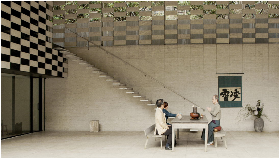
Fig. 15 The New Look of Tea Exhibition London, England, 2019