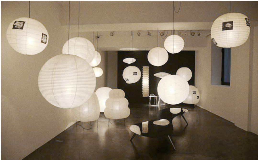
Fig. 6 Noguchi x Kriss van Asche, Galerie Downtown-François Laffanour, Paris, 2018