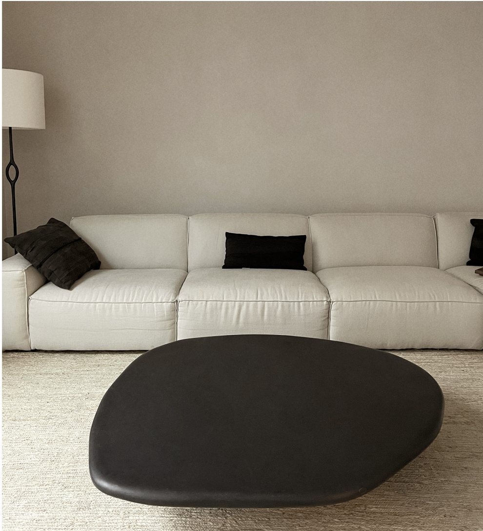
Fig. 14 Floating Stone Table, Axel Vervoordt, Slate, 46 x 48in (117 x 122cm) Los Angeles, CA, 2021 © Ronit Lee