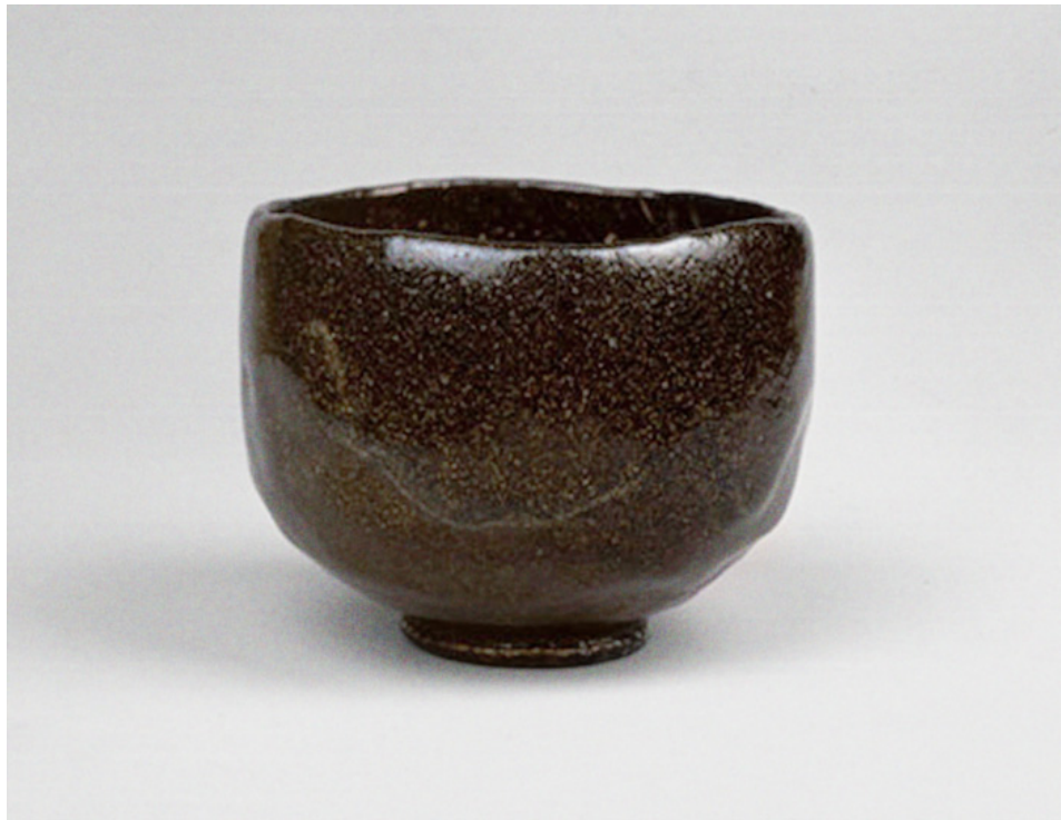
Fig. 2 Raku tea bowl, Nonkō (1599- 1659), Unknown year Makuyū glazed ceramic