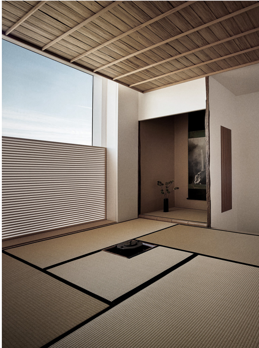
Fig. 10 Hiroshi Sugimoto, ' Ukitsu ' Tea Room, 432 Park Avenue, New York