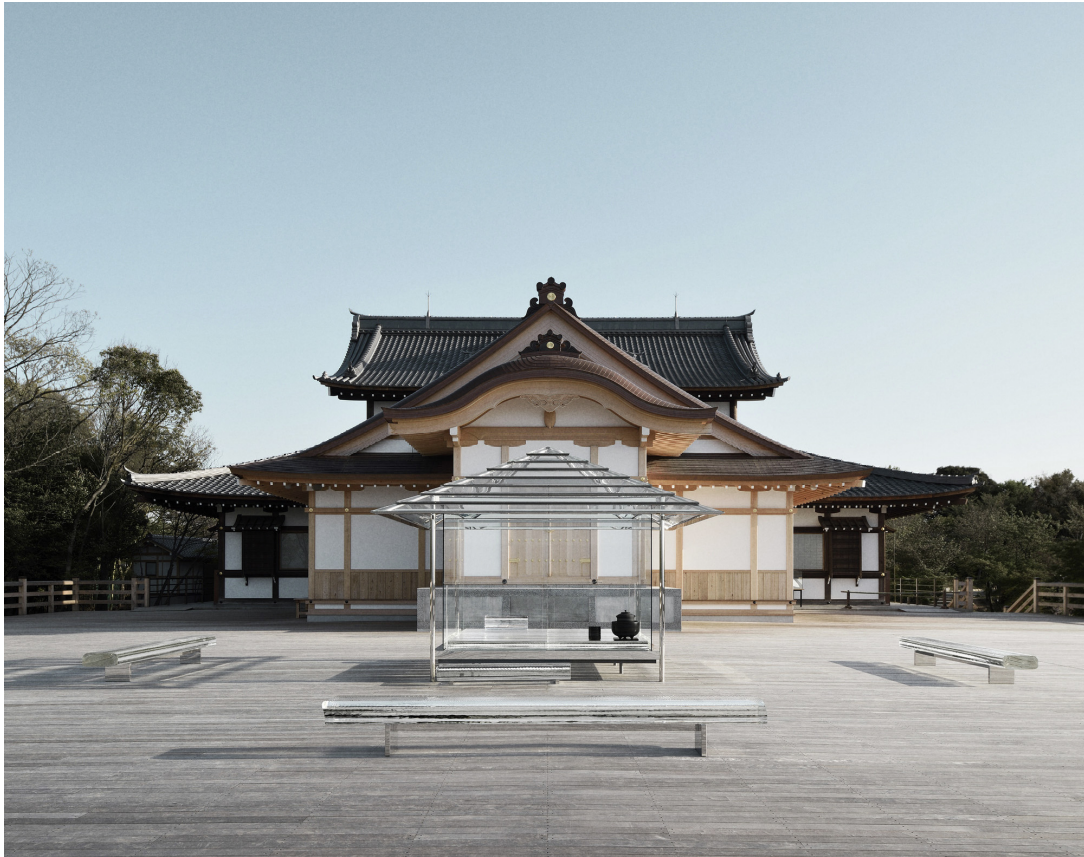
Fig. 8 ' Kou-an ' Tea House, Tokujin Yoshioka, 2015