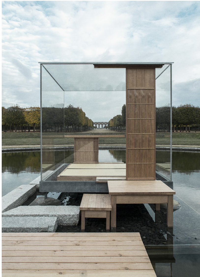
Fig. 9 'Mondrian' Tea House, Hiroshi Sugimoto, 2014