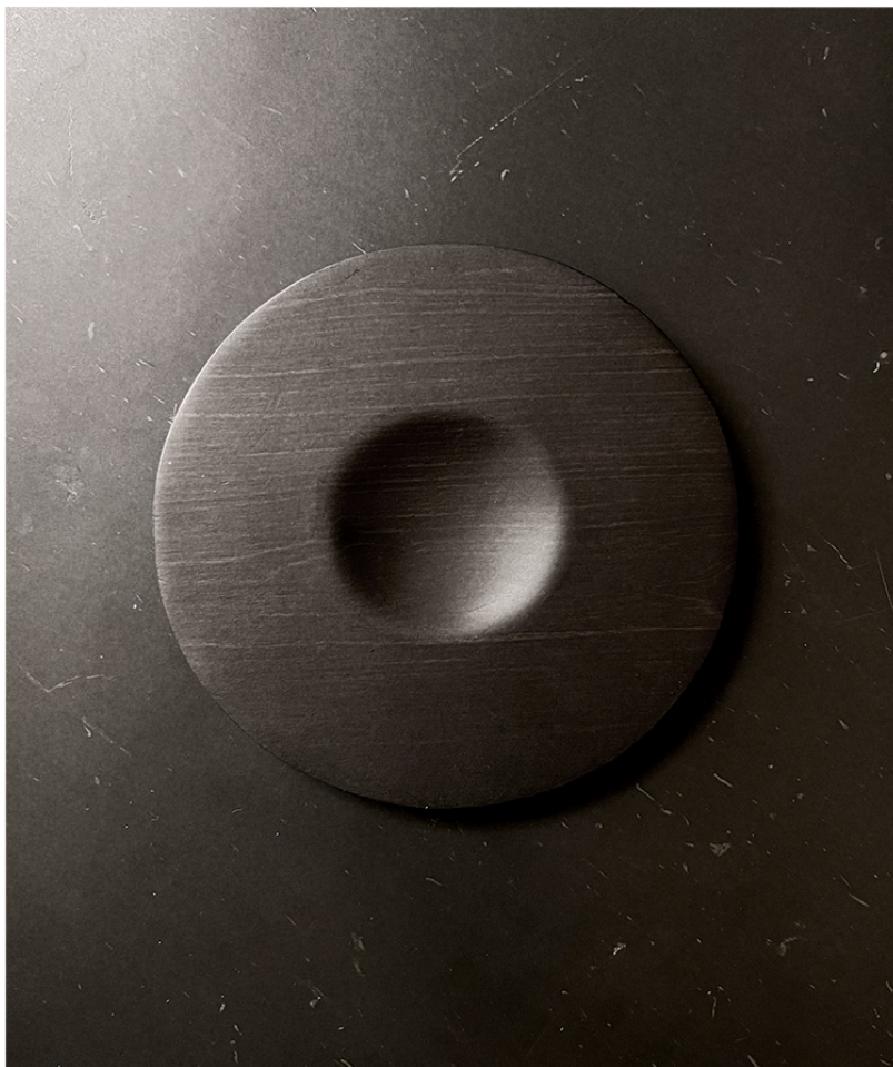
Fig. 23 John Pawson, Piatina, When Objects Work, 2005 Wood, 4 3/5 inches (11.7 cm) © Ronit Lee, 2022