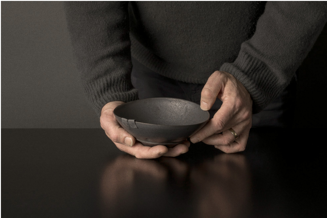
Fig. 24 Edmund de Waal, winter pot (B10), 2020 Porcelain and lead, 2 5/8 x 6 1/2 inches (6.5 x 16.5 cm) © Edmund de Waal