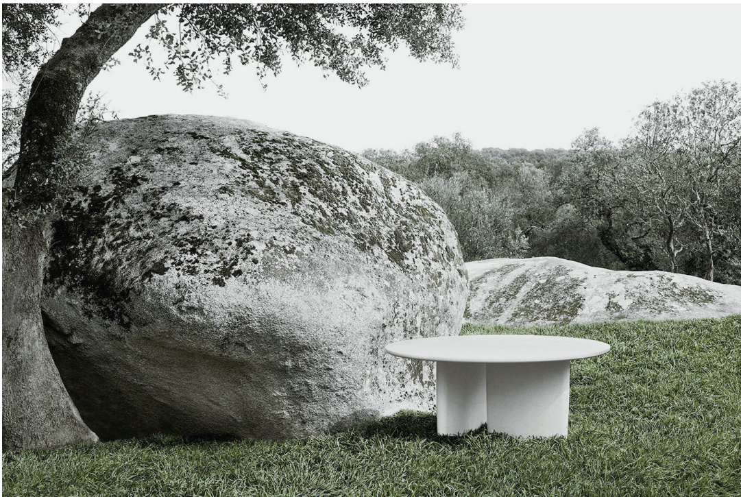
Fig. 12 Tobi-ishi Table, Barber Osgerby, B&B Italia, 2012 © B&B Italia