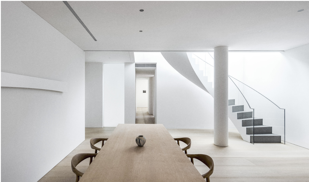
Fig. 21 Tadao Ando, Manhattan Penthouse, New York, 2019