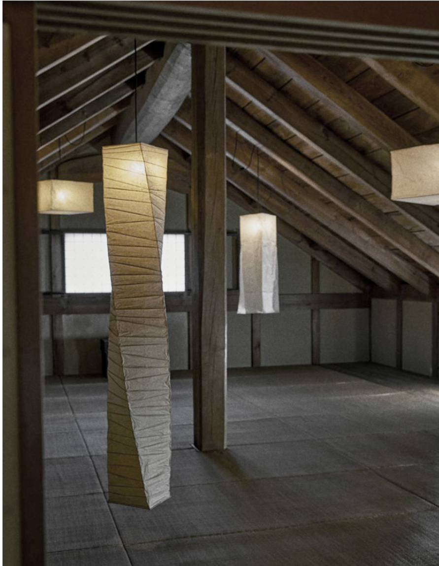
Fig. 5 Isamu Noguchi Garden Museum, Japan