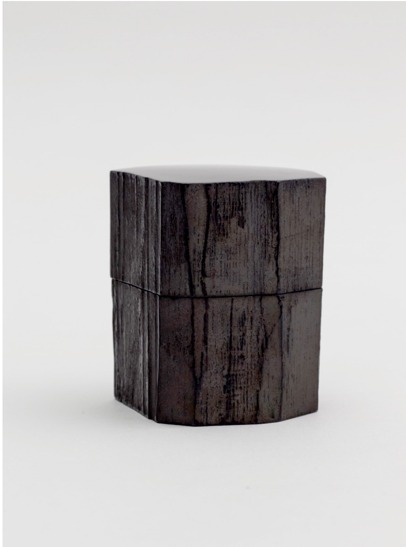
Fig. 16 ' Keyaki ' Tea Caddy, Jihei Murase III (1957 -), 2017 Lacquer, 3 1/2 x 2 3/4 inches (8.9 x 7 cm)