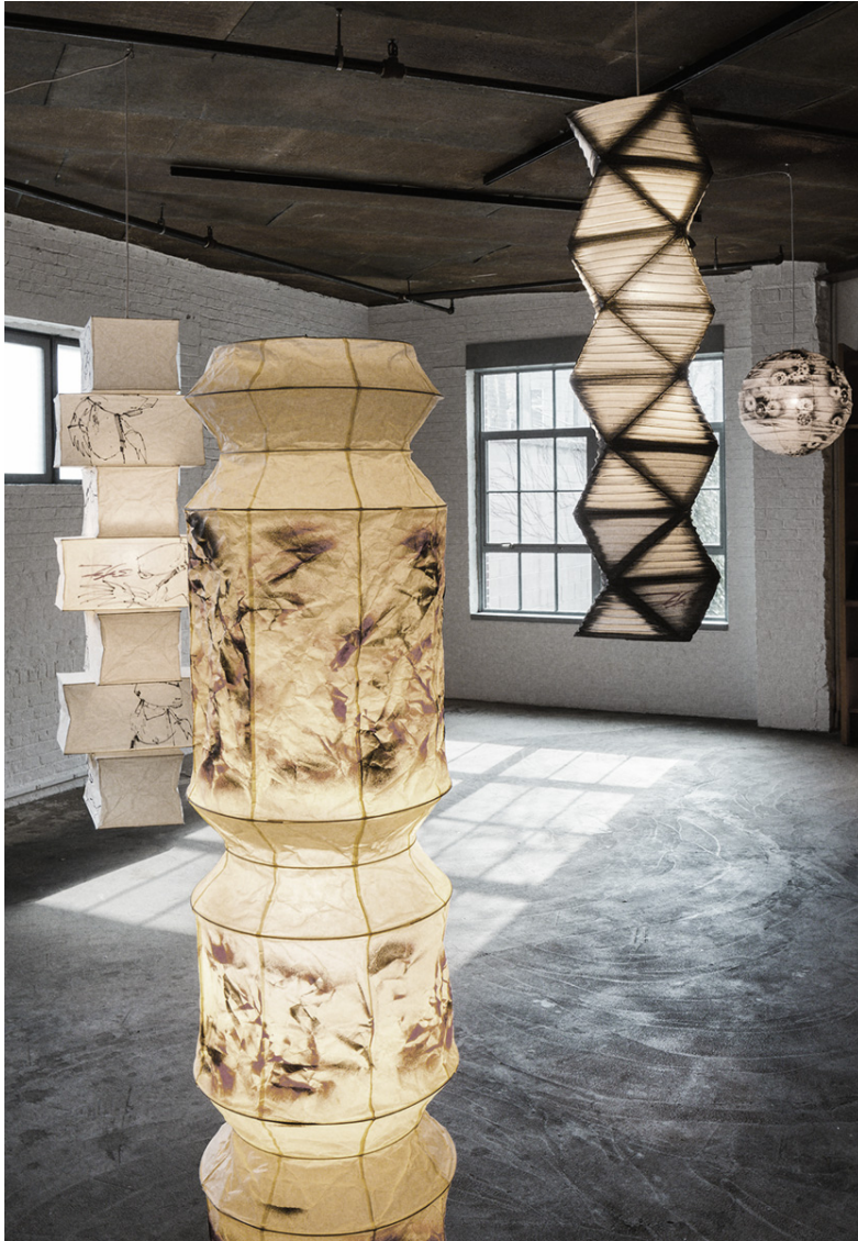
Fig. 7 Akari x Futura 2000, New York, 2021