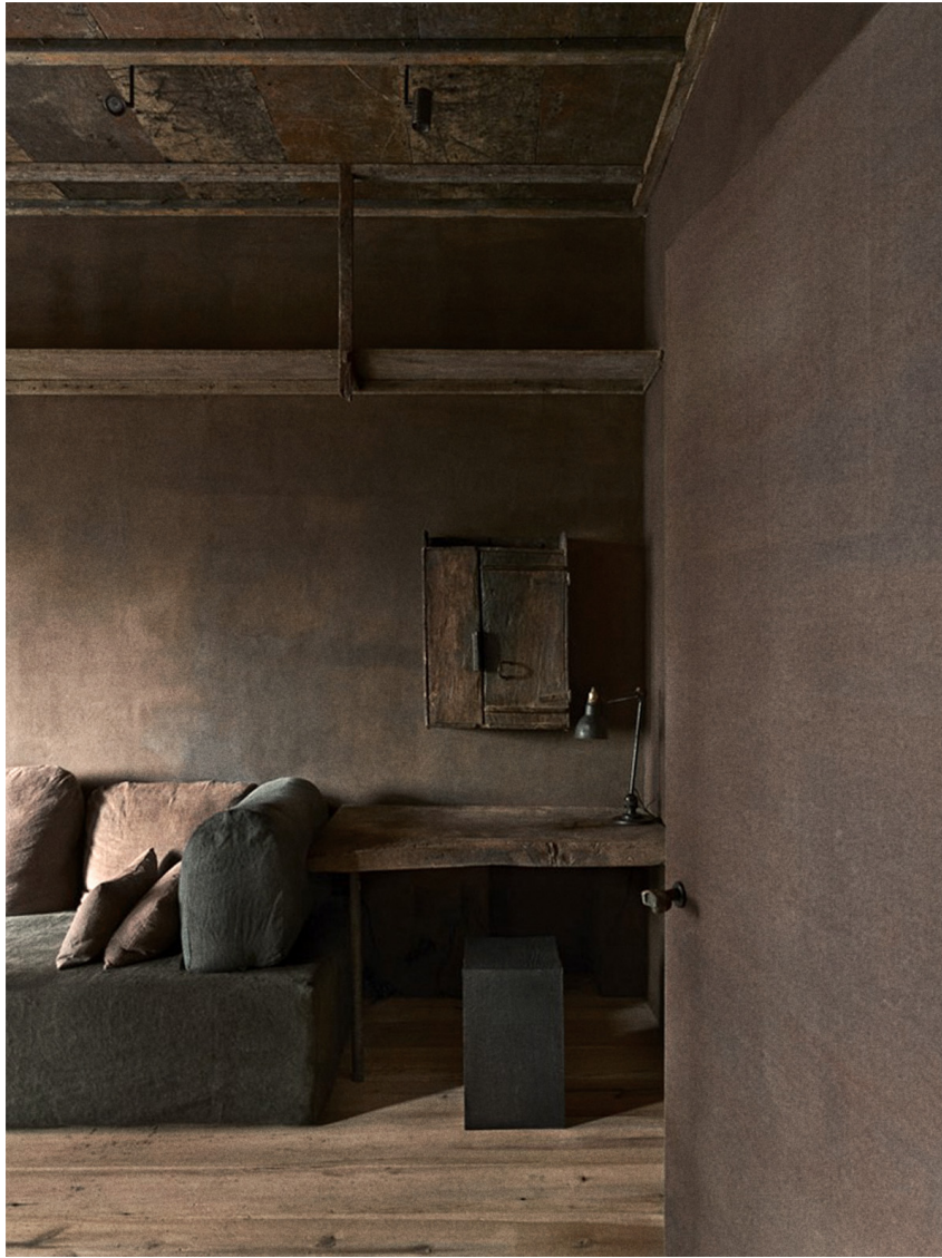
Fig. 20 Axel Vervoordt, Greenwich Hotel Penthouse New York, 2014