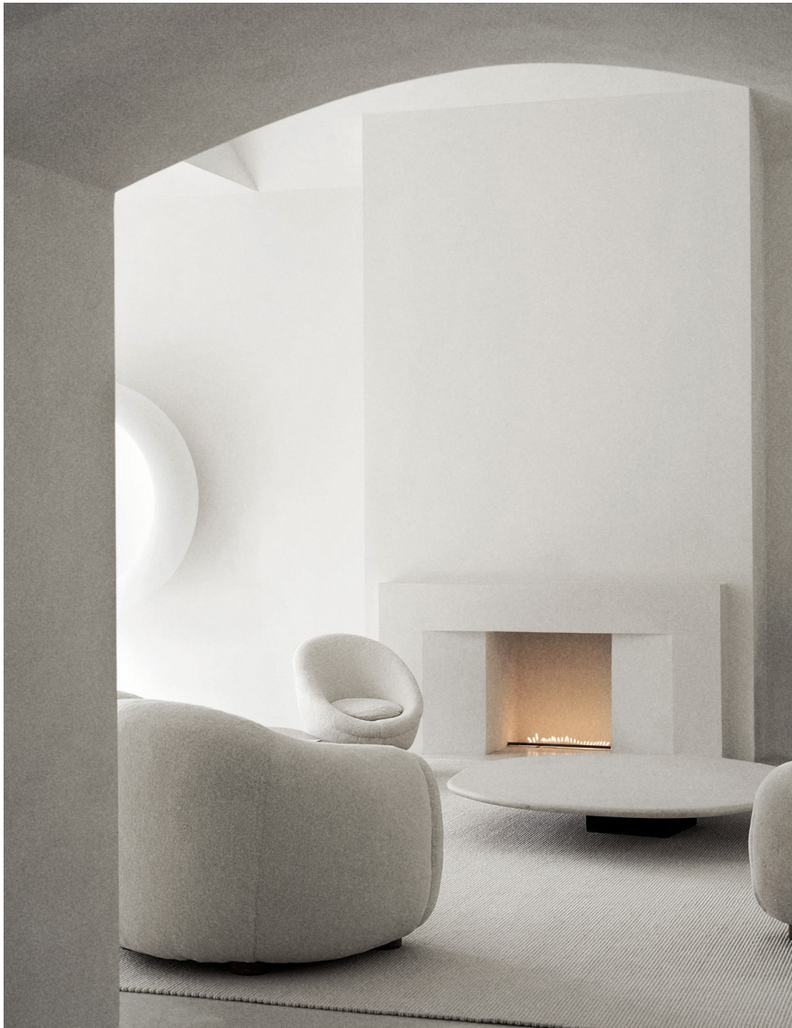
Fig. 22 Axel Vervoordt, Hidden Hills Home Architectural Digest, February 2020