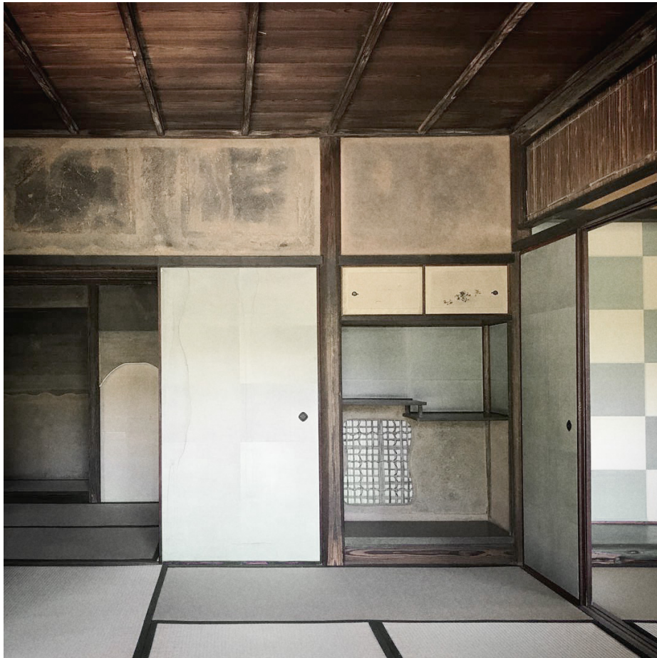
Fig. 4 Shōkin-tei Tea House, Katsura Imperial Villa (1499) Kyoto, Japan