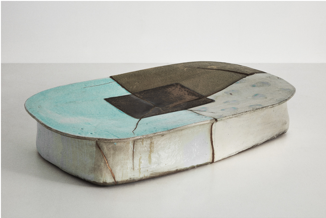
Fig. 25 Hun Chung Lee, Unique Low Table, 2018 Glazed Ceramic 40 1/4 x 24 1/4 x 7 1/2 inches (102.2 x 61.6 x 19.1 cm)