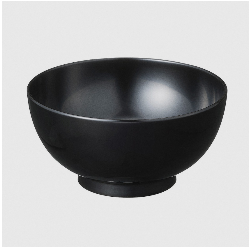
Fig. 26 Muji, Rice Bowl, 2000 Wood Flour, Melamine resin, with Lacquer, 5 3/10 x 2 3/5 inches (13.5 x 6.6 cm)