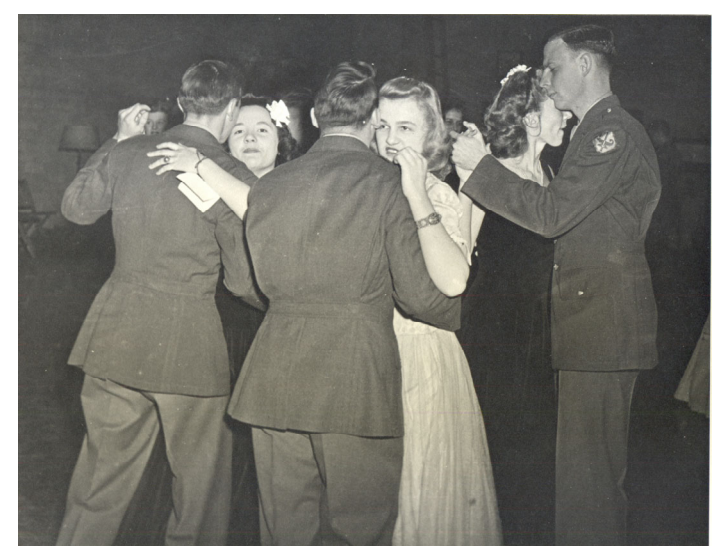
ASTP servicemen and Hope coeds at a social function, ca. 1943

"Things I don't like?—being jostled off the sidewalks into the snow—they don't whistle at me enough — I like to throw snowballs, and they won't have snowball fights—some of the fellows are too fast, although I can think of one who is o. k.—I don't get enough telephone calls; they never call."<sup>25</sup>