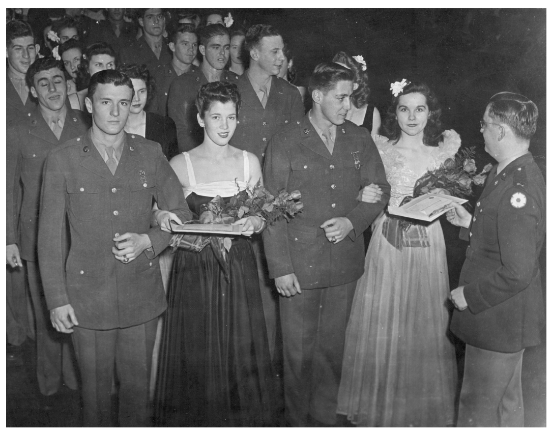
The ball held for ASTP servicemen and Hope coeds, ca. 1943

Contact us at (616) 395-7798 • Fax (616) 395-7197 • E-mail: archives@hope.edu • hope.edu/jointarchives