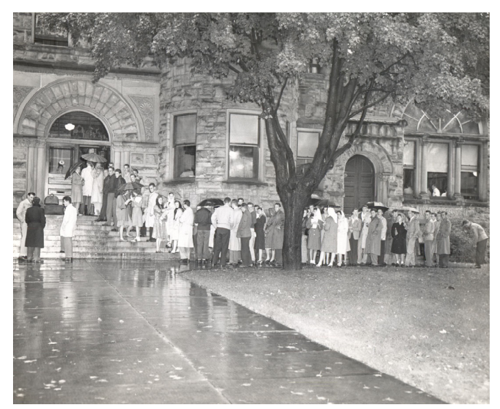
Students registering for classes outside Graves Hall, September 1946