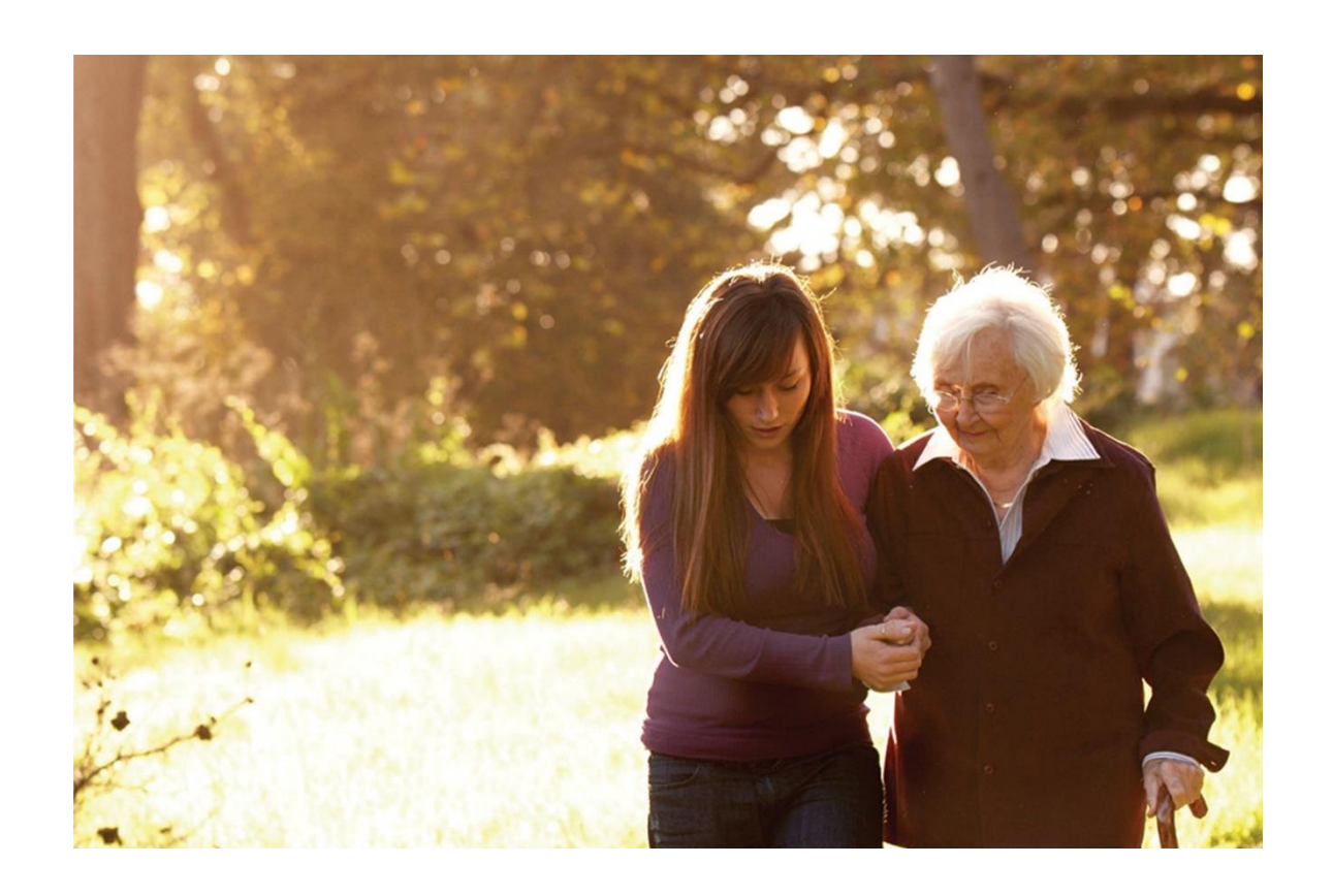
With deep gratitude..... To the selfless caregivers who shared their stories, thank you for teaching me.