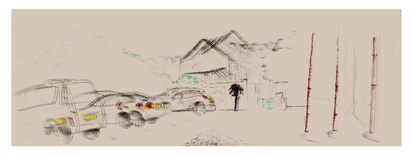
FIGURE 5A: CARPARK PARALLAX. PENCIL ON PAPER, 21x83CM, 2020.