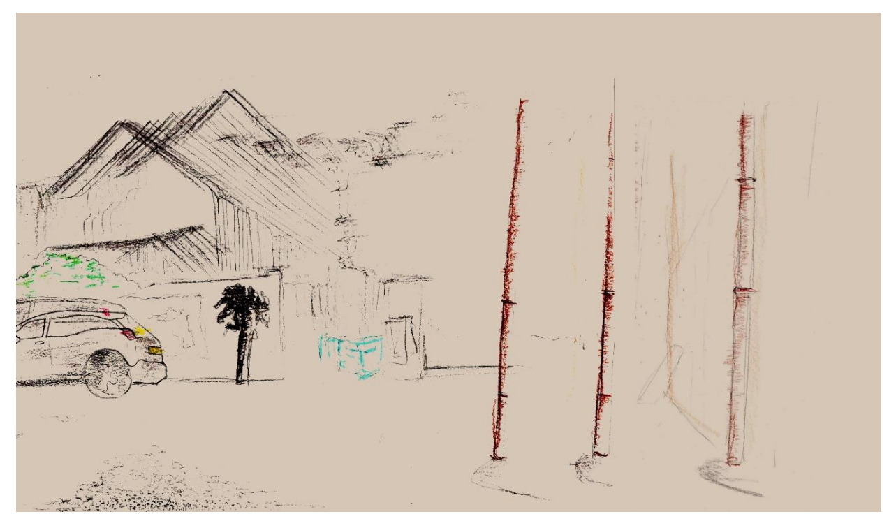
FIGURE 5B: CARPARK PARALLAX DETAIL. PENCIL ON PAPER, 2020.