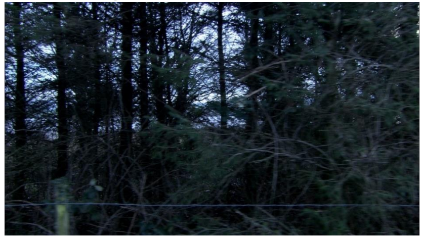
FIGURE 2: WILLIE DOHERTY, GHOST STORY (2007), HIGH-DEFINITION DIGITAL VIDEO, COLOR, SOUND, RUNNING TIME (LOOPED): 15 MIN. DALLAS MUSEUM OF ART.