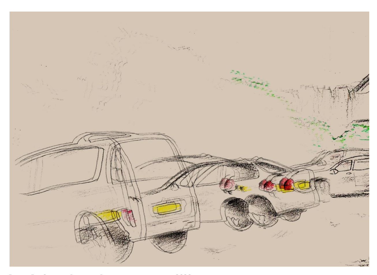
FIGURE 5C: CARPARK PARALLAX DETAIL. PENCIL ON PAPER, 2020.