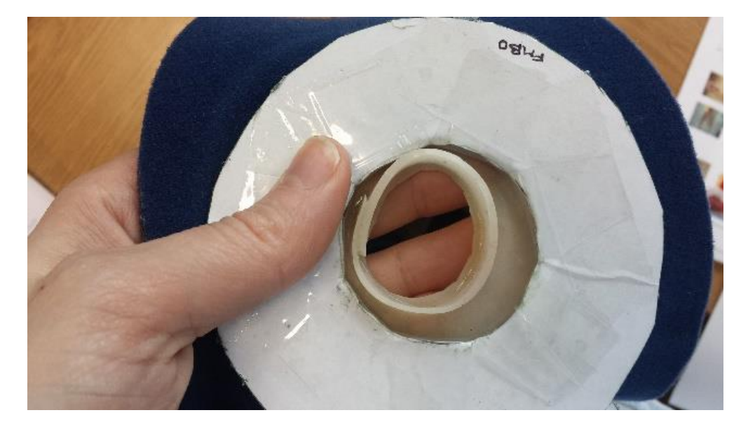
Figure 3. Early prototype

Riona: Yeah, there would have to be a seal. Like what you said there, can you bring it out and let it funnel into the bag? (Creative thinking)