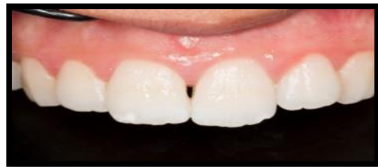
Nordland Class I