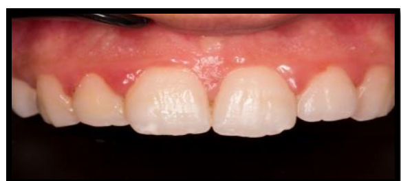
Six months postoperative following I-PRF injection protocol