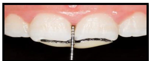
UNC color coded periodontal probe and composite stent with indentation for repeated accurate placement of the probe