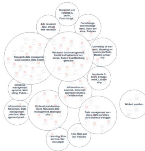
FIG. 2 CURRENT LANDSCAPE OF RESEARCH DATA MANAGEMENT [7]

The following images show the current setting of data sharing and research data management. From the OpenKnowledgeMap , in which it relates with SHARE database, we could see the following components that are largely involved in the subject: (1) skills (related to human resources), (2) technology including software and hardware, (3) easy to follow guidelines, including IPR and legal related documents.