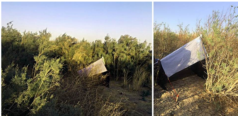
Figure 1. Malaise traps installed among Tamarix plants in the Hamoon wetlands.