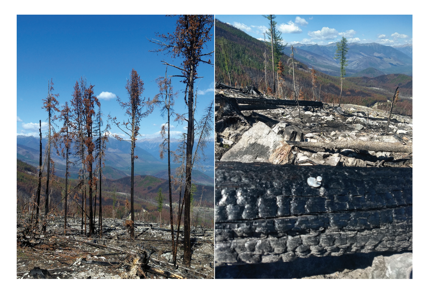
Figure 2. Post-harvest retained whitebark pine trees that were killed by the 2020 Doctor Creek Wildfire at the Lavington harvest site near Canal Flats, BC.