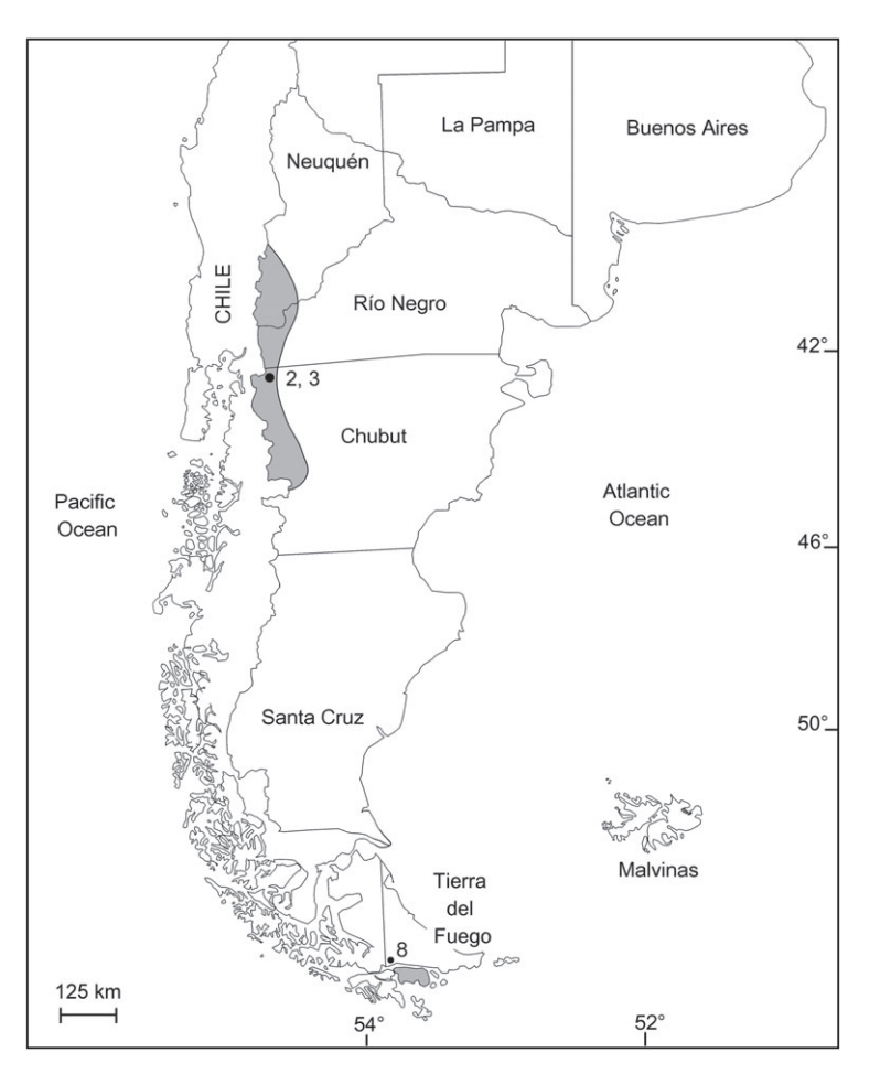
Figure 1 Distribution of Myotis chiloensis.

The shaded area on the map shows the known distribution of this species, and the dots indicate the localities added in this study (see Appendix 1).