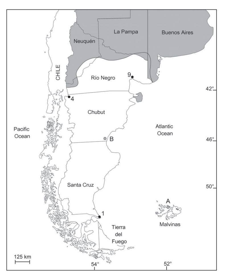
Figure 5 Southern distribution of Tadarida brasiliensis.