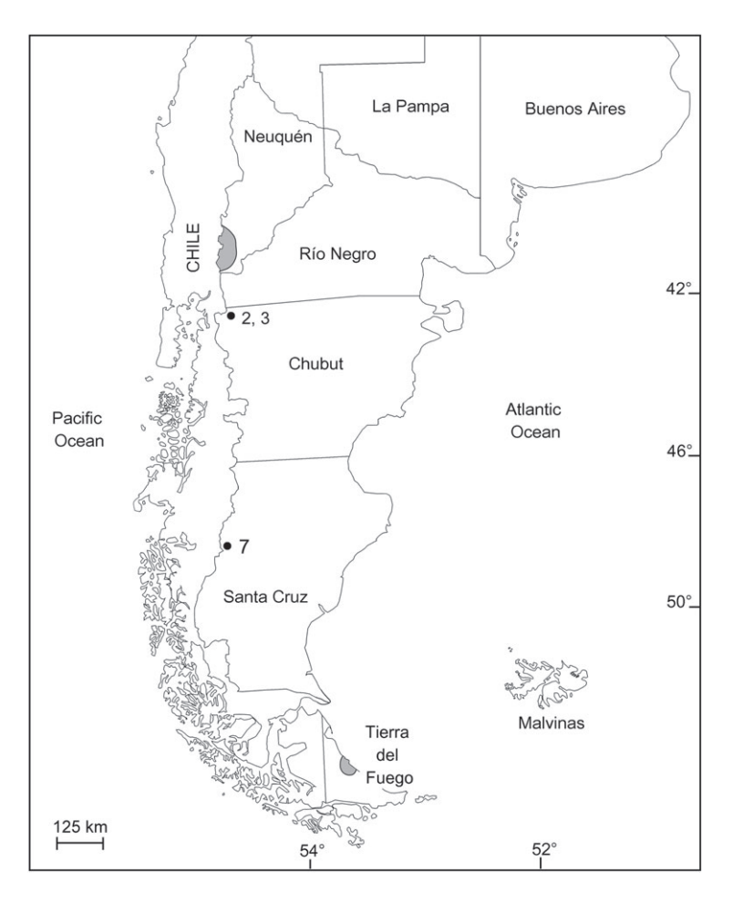
Figure 2 Distribution of Histiotus magellanicus .

The shaded area on the map shows the known distribution of this species, and the dots indicate the localities added in this study (see Appendix 1).