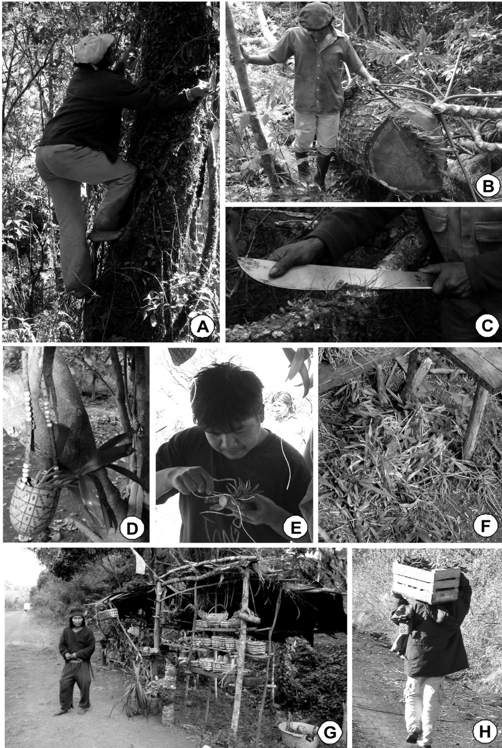
Fig. 2. A: Climbing to obtain epiphytic plants. B: felled tree for harvest orchids and other purposes. C: removing a piece of bark with orchids. D: orchids in containers of Lagenaria siceraria (Cucurbitaceae). E: tying orchids onto woody supports. F: plants «bare rooted» offered for sale. G: stall on the verge of road. H: transporting plants for sale at urban centres.