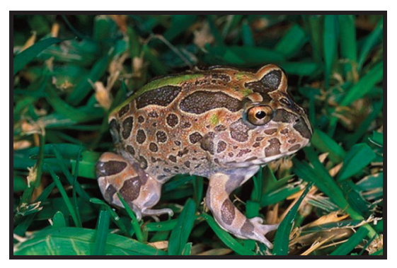
FIGURE 1. A juvenile of Chacophrys pierottii from the northwestern of Córdoba province.

The dietary habits of adults of the subfamily Ceratophryinae have been described for Ceratophrys ornata (Basso 1990), Ceratophrys cornuta (Duellman and Lizana 1994), and Lepidobatrachus llanensis (Hulse 1978). In particular, Ceratophryines are known for being top predators, and include vertebrates and siblings in their diets (Duellman and Trueb 1994). The present study on juveniles of Chacophrys pierottii (Fig. 1) represents the first report of the feeding habits of this species. The aims of the present work were: (1) to describe the diet of C. pierottii from an area of the northwestern Córdoba province, Argentina, and to estimate the relative importance of the different prey items; (2) to test for a relationship between the mean volume of consumed prey and several morphological features; and (3) compare our results with what is known for other members of the subfamily Ceratophryinae.