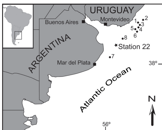
Fig. 1. Southernmost localities for Pteria colymbus and the new locality here reported: 1, Studer, 1889; 2, MACN-In 15936; 3, MACN-In 16810; 4, MACN-In 16662; 5, MACN-In 17632; 6, MACN-In 18195; 7, MACN-In 16712; 8, Pastorino et al. , 2007.

aboard the R/V Puerto Deseado on October 2009 (Fig. 1). All specimens were fixed in 10% formalin and preserved in 70% ethanol. In addition, morphometric parameters of new records and type material were measured with a digital caliper and listed in the Table 1. They are the antero-posterior length (APL), the greatest distance between the anterior and posterior over the dorsal margin of the shell and the dorsoventral height (DVH), the greatest dorsoventral distance measured from hinge line to the ventral edge. The relation APL/DVH is provided. Physical parameters were recorded and listed in Table 2. The latitude/longitude data were registered with a GPS Garmin. The sampling depth at each station was provided by the crew of the R/V Puerto Deseado and a Niskin bottle was used to collect seawater and to measure bottom temperature and salinity. Associated species are mentioned in Table 3 and identified based on the traditional catalogues and type material examination. Finally, material deposited at invertebrate collection of Museo Argentino de Ciencias Naturales (MACN-In) and Linnean Society of London (LSL) was revised. New collected specimens were housed at MACN-In and invertebrate collection of Centro Nacional Patagónico (CNP-Inv).