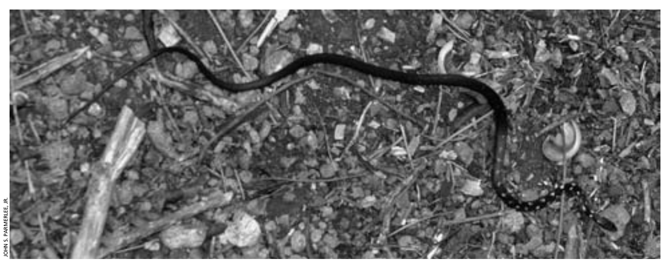
An adult Dominican Racer with an abundistic pattern in which the dark pattern elements have expanded, with only a few light patches remaining of the juvenile ground color.

tern was recorded in photographs) had 33 and 52 distinct dorsolateral light patches, with darker pattern elements blending posteriorly. The largest of the three juveniles (290 mm SVL) had 50 distinct pale dorsolateral light patches and the darker dorsal saddles were discontinuous near midbody, where 3–4 pale blotches extended middorsally through the saddle pattern. Posteriorly, the darker elements condensed into a middorsal stripe, and virtually all indications of the anterior pattern of saddles and patches were lost.