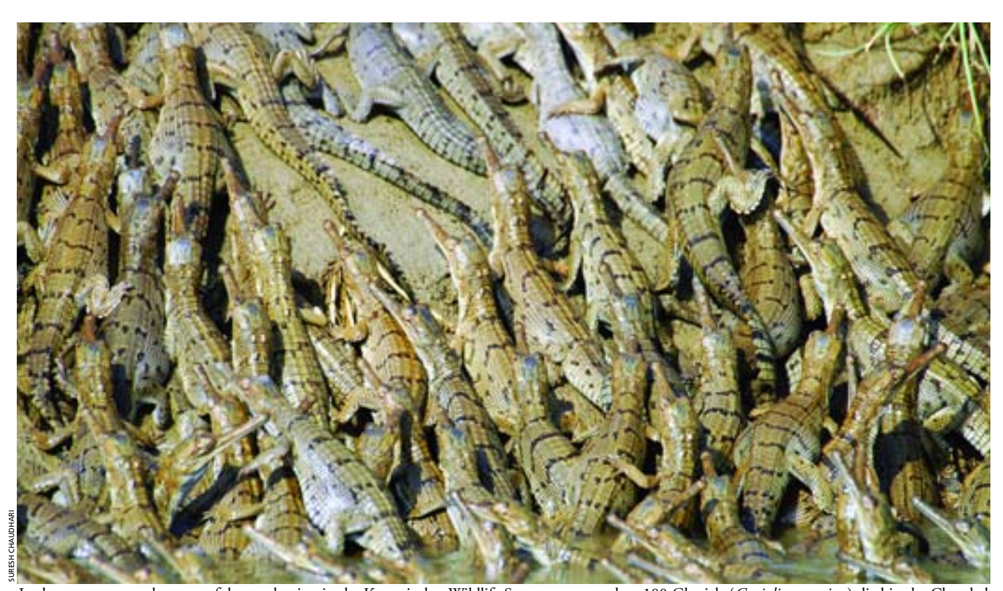
In sharp contrast to the successful reproduction in the Katerniaghat Wildlife Sanctuary, more than 100 Gharials ( Gavialis gangeticus ) died in the Chambal River Wildlife Sanctuary this year. An unidentified toxin is suspected of causing kidney damage and failure. See article on p. 150.