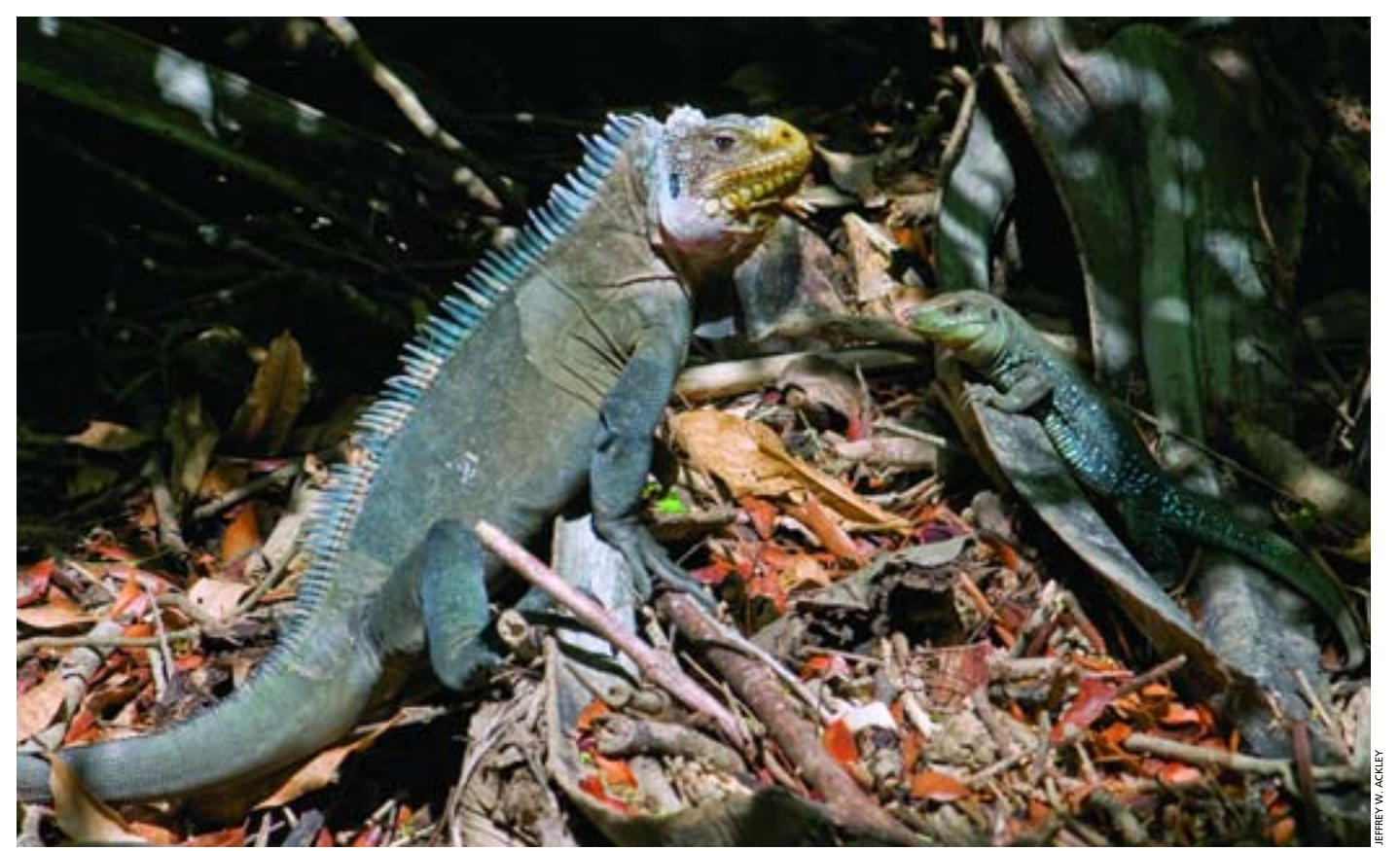
Lesser Antillean Iguana ( Iguana delicatissima ) are almost exclusively herbivorous (the yellow color on the iguana's face is from eating mangos) and largely arboreal, descending to the ground to forage or defend territories for only short periods each day. Dominican Ground Lizards ( Ameiva fuscata ) are almost entirely terrestrial and are opportunistic foragers that feed mostly on small invertebrates, but will eat fruits when available. These two individuals came into close proximity to bask in a small patch of sunlight. See article on p. 130.