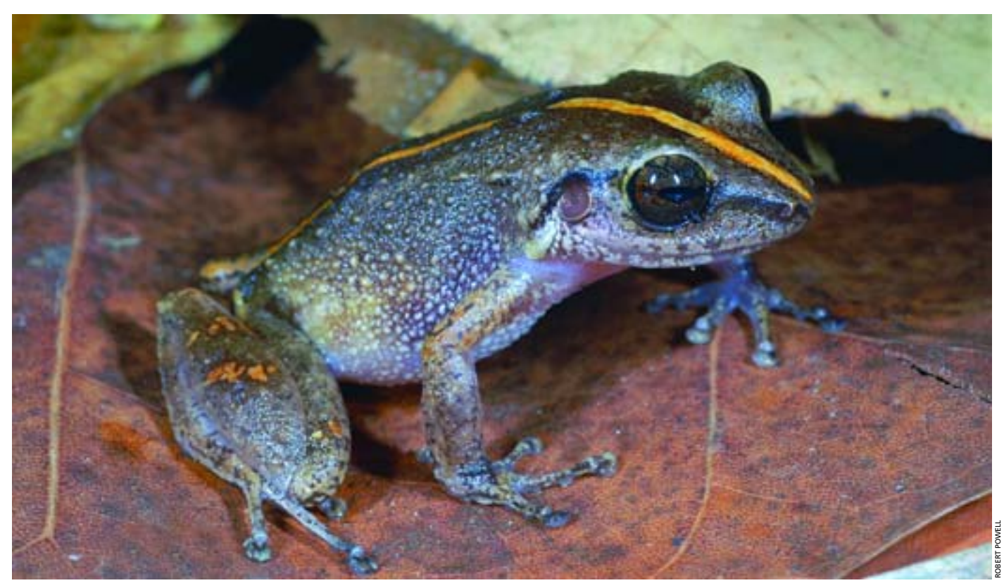
Martinique Frogs ( Eleutherodactylus martinincensis ) are ubiquitous on Dominica. This individual has an unusually distinct middorsal "racing" stripe, a pattern element sometimes seen in the Dominican Frog ( E. amplinympha ), which is restricted to higher elevations on the island. See article on p. 130.