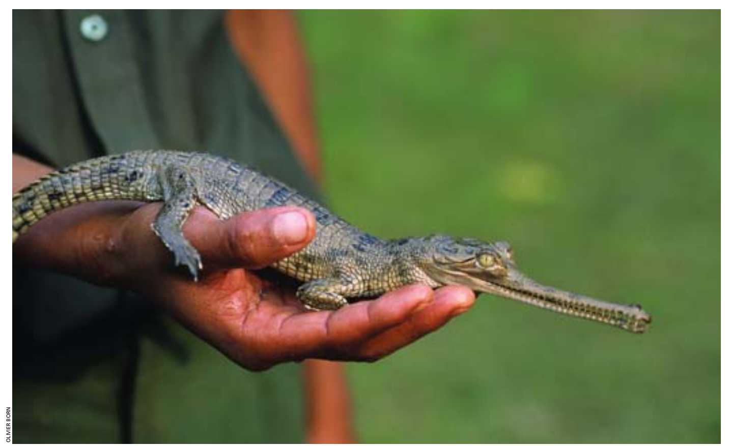
The Katerniaghat Wildlife Sanctuary is a secure refuge and the best hope for protecting Gharials ( Gavialis gangeticus ) from extinction. In April of this year, 26 females laid eggs in a soft and secure sand bar on an island in the Girwa River where nesting had been facilitated by clearing grasses and softening sand by digging. About 1000 Gharials hatched this year at one location along the river, but many were swept away by monsoon floods, for which protective measures will have to be developed in the future. See article on p. 150.