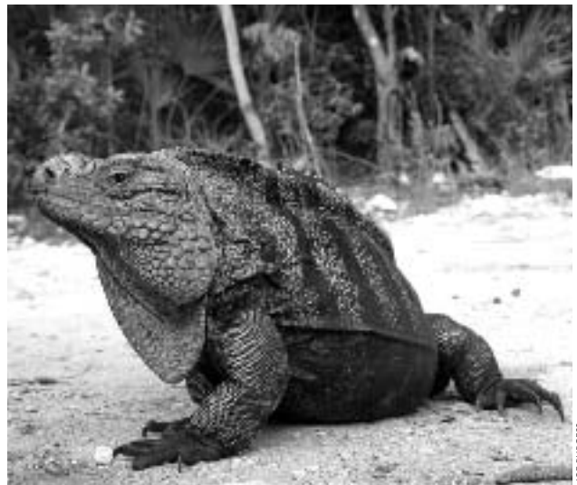
Resident male Cyclura cyclura cyclura at Tiamo Resort, Andros.

Fourteen months have now passed since Hurricane Ivan, a category 4–5 hurricane, tracked along the southern coast of Grand Cayman causing catastrophic damage to human property and livelihoods, and delivering dramatic impacts to natural environments. Aerial photographs eight months after the storm show the