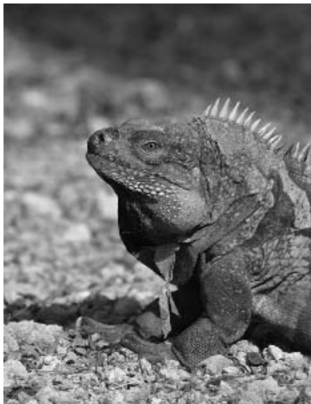
Ricord's Iguana ( Cyclura ricordii ) at ZooDom.

Grupo Jaragua, ZooDom, and Indianapolis Zoo have been working together to develop a Ricord's Iguana ( Cyclura ricordii ) curriculum directed toward the 3rd grade classroom. This work is funded by grants from the U.S. Fish and Wildlife Service - Wildlife Without Borders Latin America and Caribbean Program, and AZA's Conservation Endowment Fund. The curriculum includes a booklet with natural history information about the species and its habitat, vocabulary words, maps, etc. Resource kits consist of a plastic bin that students will fill with sand. Plastic eggs, cacti, thermometers, light bulbs, etc. allow students to pretend to incubate eggs and take sand temperatures. A game board with iguana questions and a poster are provided for every classroom. Teacher workshops will be held in Santo Domingo, and in the towns closest to Ricord's Iguana habitat this spring, and the curriculum will be implemented this fall. The