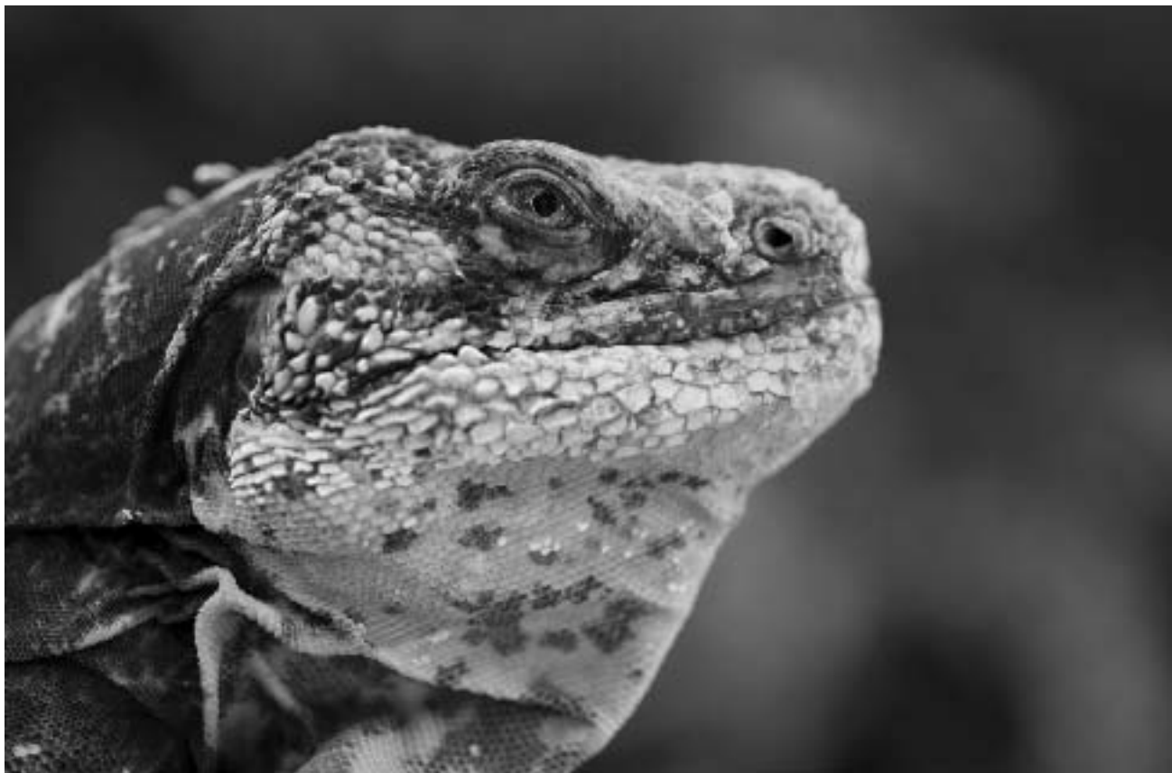
Honduran Black-chested Spiny-tailed Iguana ( Ctenosaura melanosterna ).

Mesoamerica has been defined as one of the Earth's biodiversity hotspots. The Ctenosaura group exemplifies this pattern because it is an incredibly species-rich clade; however, it has received little attention thus far in scientific research. In order to evaluate plausible explanations for speciation within this clade, I plan to: (1) construct a molecular phylogeny of the iguanas of the Ctenosaura melanosterna complex inhabiting the Caribbean borders and islands of Honduras, the heart of Mesoamerica (using