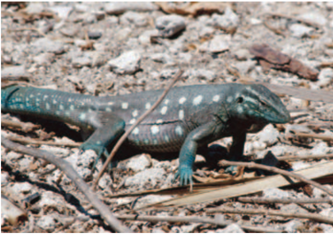
An adult male Curaçao Whiptail ( Cnemidophorus murinus ) threatening a rival, which is outside the field of view.

with salad, which is often shared with lizards. One of the operators used to feed the lizards all remaining salad, but he has stopped doing so. Possibly as a consequence of the supplemental food, lizard numbers had been increasing and densities almost certainly exceeded the natural carrying capacity of the island. When one walks around the island, one is struck by the fact that lizards near the tourist facilities are considerably larger and better fed than those in the farther reaches of the islet and that the well-fed males maintain or have especially bright blue colors. This would tend to argue against the hypothesis that bright blue colors arise as a result of poor nutrition or nutritional deficiencies. The well-fed lizards are still markedly smaller than their brethren on Curaçao, which