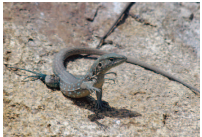
“Paw-waving” behavior in a young Aruba Whiptail ( Cnemidophorus arubensis ) from Aruba. In the Honduran Bay Islands, similar behavior in C. lemniscatus is responsible for the local name “Shaky-Paw.”

The Aruba Whiptail Lizard ( Cnemidophorus arubensis ) is locally called Kododo. Used for both males and females, this old Caquetío name is also used on Bonaire for C. ruthveni . Cnemidophorus arubensis is a common lizard found practically everywhere. Males are gray or gray with some brown