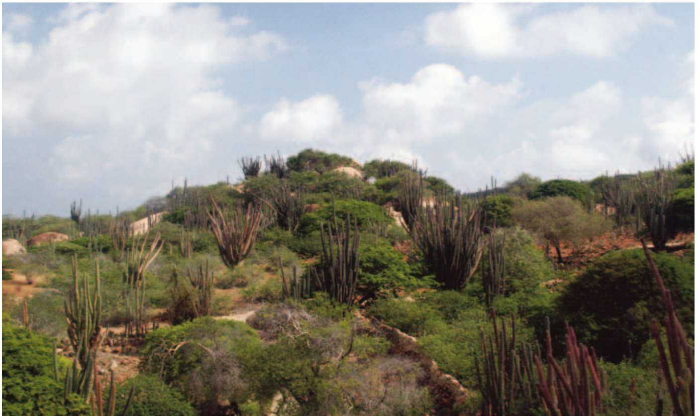
Cunucu Arikok, characterized by large tonalite blocks (a type of andesite rock) that are typical over much of the Aruban landscape.