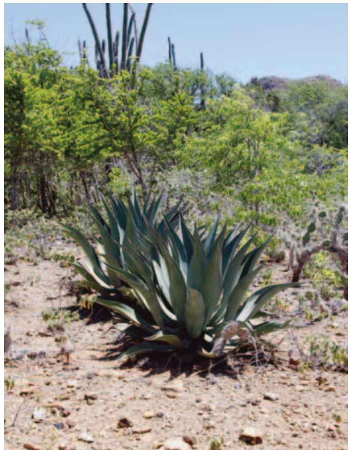
Agave vivipara is found only on Aruba, Curaçao, and Bonaire.