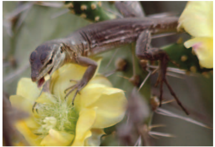
Juvenile Curaçao Whiptail ( Cnemidophorus murinus ) eating a Prickly Pear ( Opuntia sp.) flower.