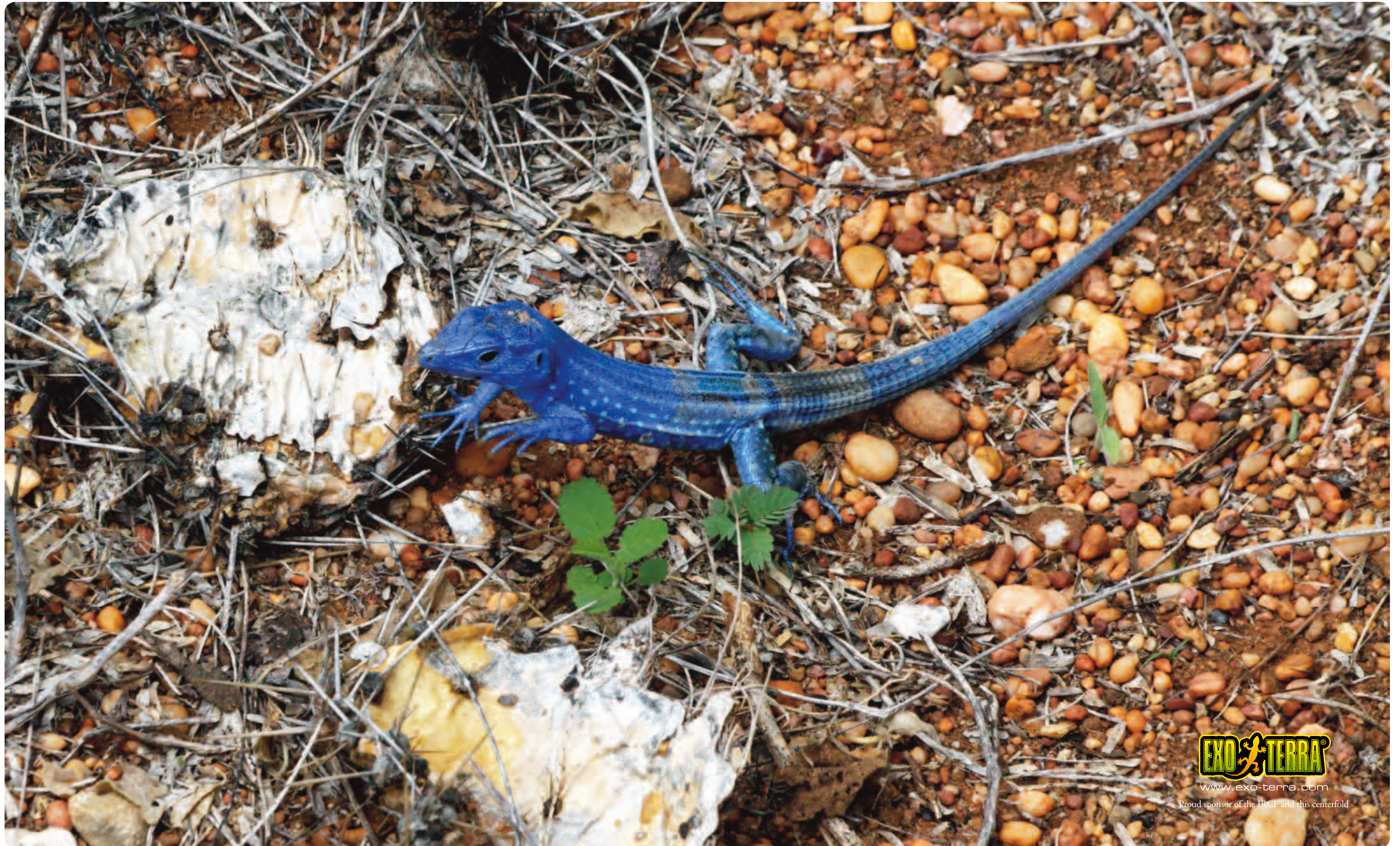
A Blue Lizard ( Cnemidophorus lemniscatus splendidus ) from the Fundo San Francisco on the Paraguán Peninsula of Venezuela.