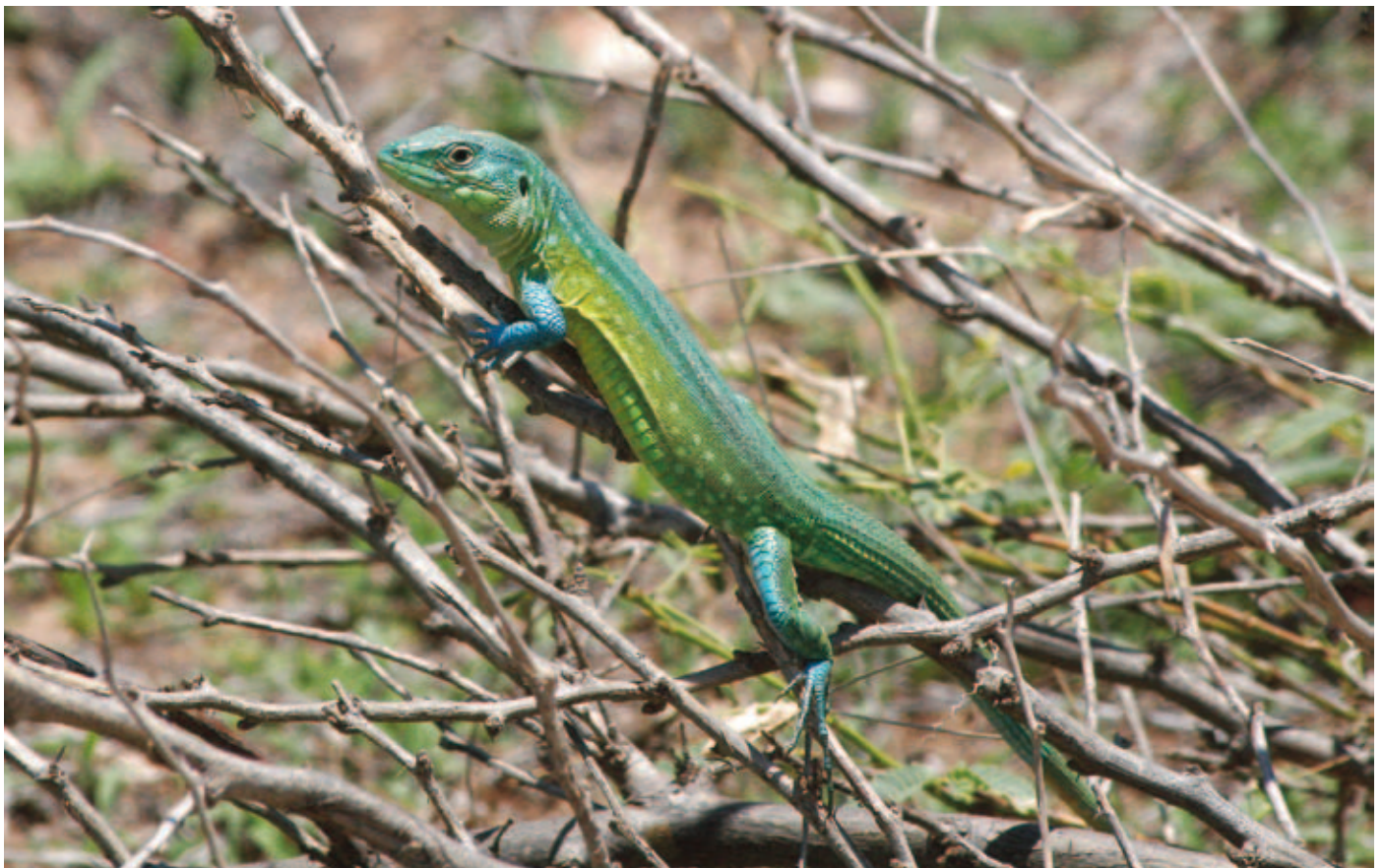
Rainbow Whiptails ( Cnemidophorus arenivagus ) have been introduced in Aruba, where they have gradually extended their range in the southeastern part of the island; this one was photographed in the area around Vader Piet.