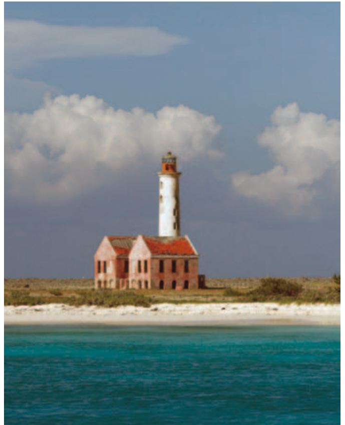
This lighthouse was built in 1879 after a large hurricane had destroyed the previous lighthouse on the 22/23 September 1877.

with salad, which is often shared with lizards. One of the operators used to feed the lizards all remaining salad, but he has stopped doing so. Possibly as a consequence of the supplemental food, lizard numbers had been increasing and densities almost certainly exceeded the natural carrying capacity of the island. When one walks around the island, one is struck by the fact that lizards near the tourist facilities are considerably larger and better fed than those in the farther reaches of the islet and that the well-fed males maintain or have especially bright blue colors. This would tend to argue against the hypothesis that bright blue colors arise as a result of poor nutrition or nutritional deficiencies. The well-fed lizards are still markedly smaller than their brethren on Curaçao, which