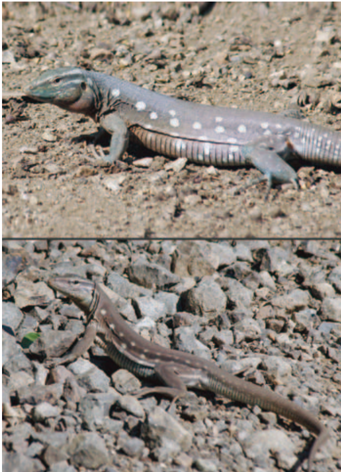
Male (top) and female (bottom) Curaçao Whiptails ( Cnemidophorus murinus ). Note the red mites in a mite pocket behind the hindleg and on the tail of the male. These probably belong to the family of the Trombiculidae (commonly known as Chigger Mites).

The Curaçao Cnemidophorus murinus is larger than C. arubensis and also somewhat larger than C. ruthveni on Bonaire. These lizards are light gray with blue on the feet and tail and some blue on the head. Large males are locally called Blausana, Blaublau, or Blòbò, which is derived from the Dutch word blauw (= blue). Blòbò is also used as a derogatory name for the police, who have blue uniforms. In dominant males, the blue is brighter, although the brilliance of the blue seems to vary during the year. Juveniles are brown and the females remain brown, sometimes with a slight shade of gray. Females and juveniles are called Lagadishi, which is also a general name for lizard or lizards. Lagadishi is derived from either Portuguese “lagartixa” or Spanish “lagartija,” which in turn go back to Latin “lacerta.” These lizards are very common and are found practically everywhere. Female C. murinus lay only one large egg at a time. This also holds true for C. arubensis (Schall 1983) and C. ruthveni . Might this be an adaptation to increase the odds of young surviving in an arid climate? A similar adaptation is found in Green Iguanas ( Iguana iguana ). Clutch size is smaller but eggs are larger in females from Curaçao when compared to mainland iguanas (van Marken Lichtenberg and Albers 1993).