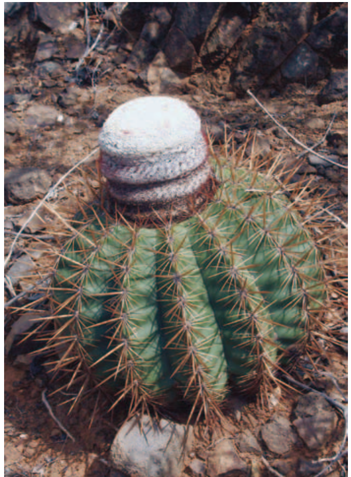
Large Melocactus macracanthus from Curaçao. These cacti occur on Aruba, Curaçao, and Bonaire. Note the large straight spines, unlike the recurved spines of M. curvispinus from Paraguana.