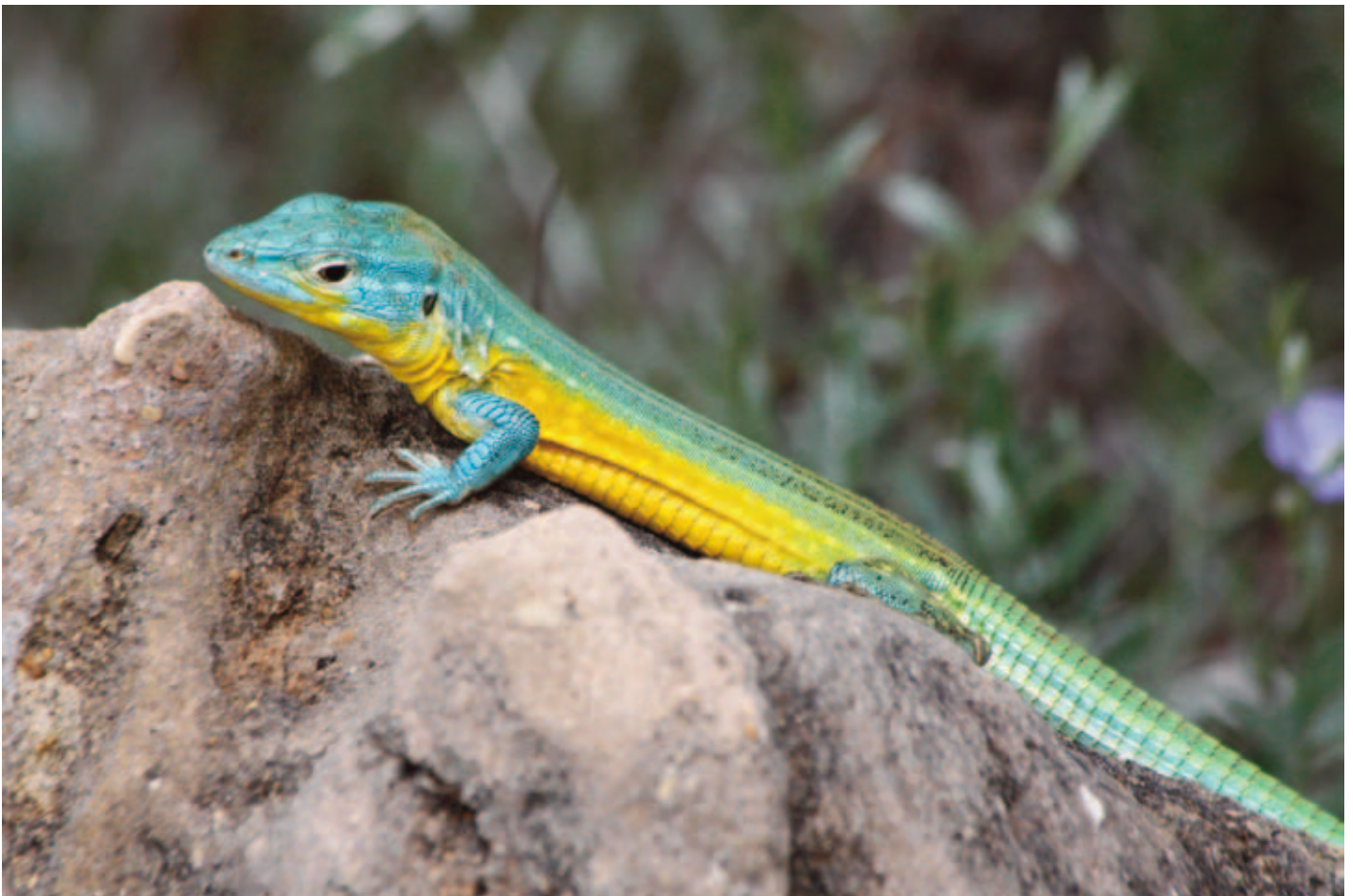
An unusually colored Cnemidophorus from the Fundu San Francisco. This individual is quite unlike typical C. arenivagus found in that area, nor does it look like C. lemniscatus splendidus . Might it be a hybrid?