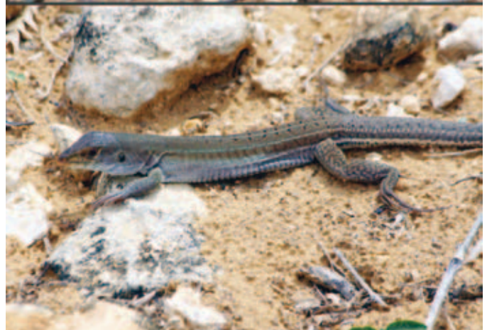
Male (top) and female (bottom) Ameiva bifrontata from Camunare, 2 km NNW of Baraived in Paraguaná. Note the ticks on the right shoulder and the bluish color on the sides of the male. In male A. bifrontata from Aruba, this bluish color is normally absent or almost unnoticeable. Female A. bifrontata from Aruba often lack the dark brown stripes and dorsal triangles or they are much less distinctly expressed.