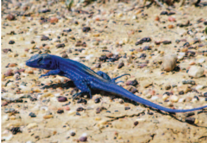
A deep cobalt-blue Cnemidophorus lemniscatus splendidus from Sisibauco. Note the "paw-waving" behavior peculiar to some species of Whiptail Lizards.

I could approach C. lemniscatus splendidus so closely that I could not focus and had to step back. One would not expect this latter behavior from wild mainland animals. On an island, animals often can be approached quite closely and, generally speaking, the smaller the island, the tamer the animals. This leads me to think that there might be some truth to the contention of some local residents that blue color conveys some form of protection.