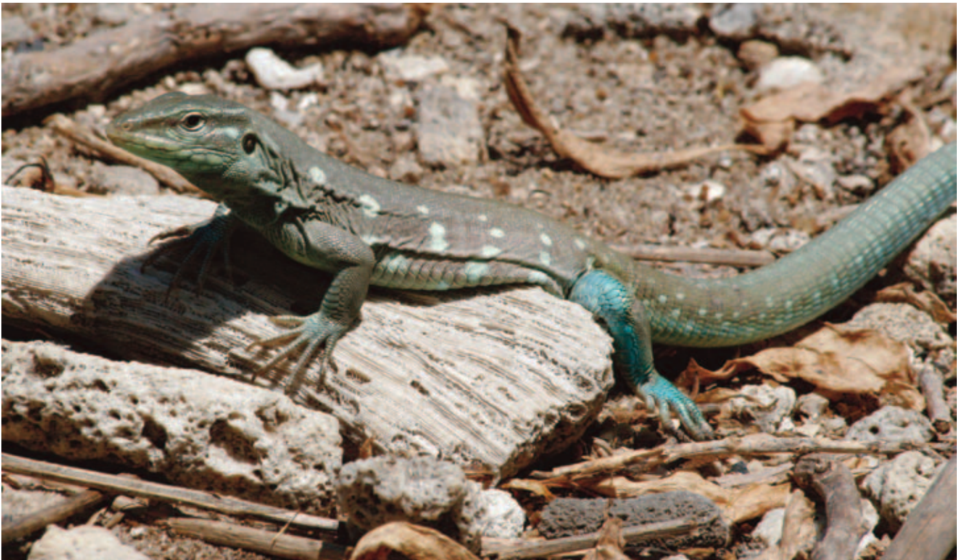
Male Curaçao Whiptail ( Cnemidophorus murinus ) from Klein Curaçao with bright aqua-blue coloration, especially on the hindlimbs; compare this picture with the more muted colors of C. murinus from Curaçao.