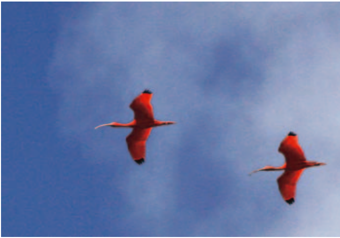
Scarlet Ibis ( Eudocimus ruber ) flying in to the lagoon in the Quebrada Sabría.

Locals on Paraguaná say that snakes do not like to eat the “Bizurre” or “Visure,” which are local names for Cnemidophorus lemniscatus splendidus , which is also called “Lagartija azul.” While photographing these animals, I was surprised that these blue lizards could be approached much more readily than the yellow-brown-green Rainbow Whiptail Lizards ( C. arenivagus ). The latter, locally called “Lagartija verde,” are found in many areas with sandy soil and can be very abundant in the dunes along the coast. In some