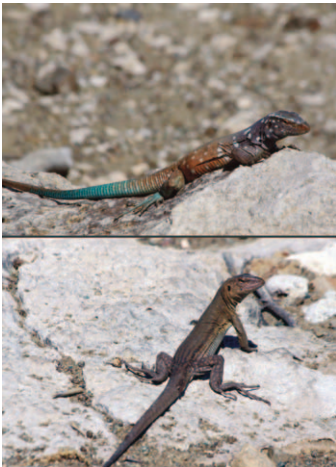
Male (top) and female (bottom) Bonaire Whiptails ( Cnemidophorus ruthveni ).