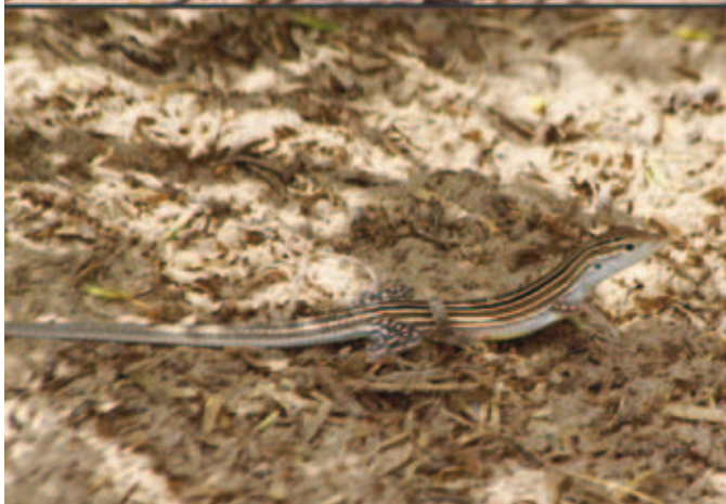
Male (top) and female (bottom) Rainbow Whiptail Lizards ( Cnemidophorus arenivagus ) from the dunes and sandy areas along the coastal road from Adicora to Coro, south of La Bocaina, Paraguaná.