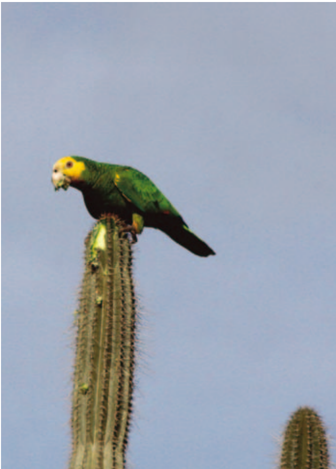
An endangered Yellow-shouldered Amazon ( Amazona barbadensis ) feeding on a Candelabra Cactus ( Cereus repandus ) in Bonaire.