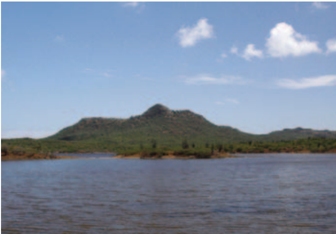
Brandaris, at 241 m the highest hill in Bonaire, is in the Washington/Slagbaai National Park.