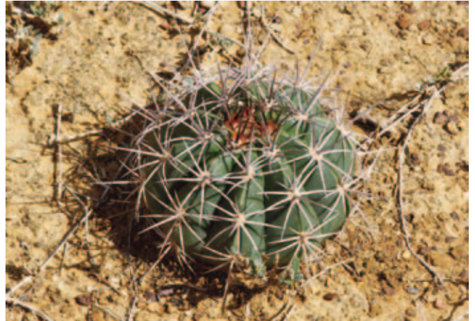
Melocactus curvispinus is common in Paraguaná. Note the recurved spines reflected by the species' scientific name and compare it with M. macracanthus , which is found in Aruba, Curaçao, and Bonaire.

areas, the two species occur sympatrically, although C. lemniscatus splendidus is generally found nearer the center of Paraguaná, often in association with dry tropical forest. In an area near the Fundu or Villa San Francisco, where both species occur, the differences in behavior were especially obvious. Using a 300-mm telephoto lens, I could not get near C. arenivagus , which was quite wary, and I did not manage to take any photographs. In sharp contrast,