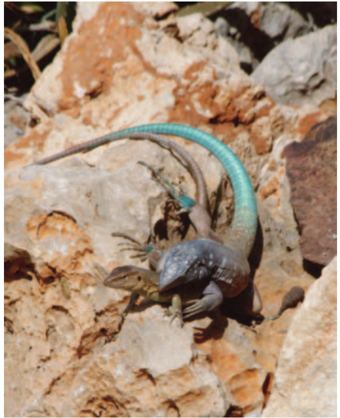
Mating pair of Bonaire Whiptails ( Cnemidophorus ruthveni ). Note the marked male-biased sexual size dimorphism.

The Bonaire Whiptail ( Cnemidophorus ruthveni ) is slightly smaller and differs in coloration when compared to C. murinus on Curaçao. Previously considered a subspecies of C. murinus ( C. murinus ruthveni ), Ugueto and Harvey (2010) recently elevated the taxon to full species status. On Bonaire, both the names Kododo and Blausana or Lagadishi are used. The head, front legs, and posterior parts of the body of males are gray and the dots on the head are very distinct. The lower body, hindlegs, and upper tail are khaki-colored, the underside of the tail is blue. Females are brown and the flanks and hindlegs have many faint dots, resulting in a marbled appearance. As with C. murinus on Curaçao, these lizards are found practically everywhere.