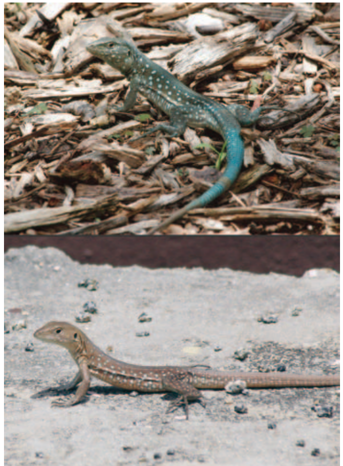
Male (top) and female (bottom) Aruba Whiptails ( Cnemidophorus arubensis ) from Aruba. As males mature, they change in color from yellow-brown or light brown to gray and blue.

On Aruba, Ameiva bifrontata is called “Koffie cu lechi” (= coffee with milk) in reference to its color, but the name “Vloem” or “Floem” is sometimes used as well. Ameiva bifrontata is predominantly light khaki-brown with a light green or grayish-green infusion on the head and front of the body. Some have questioned whether A. bifrontata was introduced in Aruba or whether it is indigenous. While Wagenaar Hummelinck was working