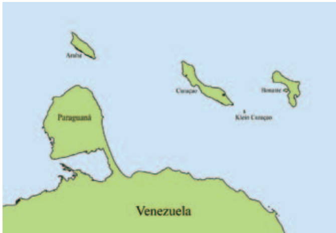
Map showing the locations of Aruba, Bonaire, and Curaçao in relation to the Paraguaná Peninsula of Venezuela.