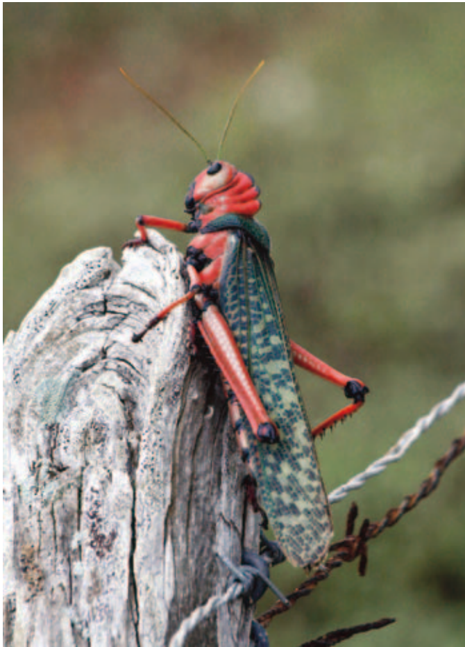
Large locusts called Langoston ( Tropidacris cristata ) are very common in Paraguaná.