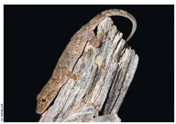
Fig 6. Wood Slave (Hemidactylus mabouia) from Salt Cay, Turks and Caicos Islands.

Wood Slaves (Fig. 6) are rapidly expanding their range in the Western Hemisphere, and are firmly established in the Turks and Caicos Islands. These lizards are exceptionally good colonizers and, as human commensals, are afforded frequent opportunities to stow away in cargo, which is probably how they arrived in the Turks and Caicos. They are widely distributed in the Turks and Caicos and are currently known from six large islands: Providenciales, North and Middle Caicos, South Caicos, Grand Turk, and Salt Cay (Reynolds and Niemiller 2009), although they likely occur on many more. We have discovered nests on Salt Cay (Fig. 7) and have recorded juveniles and hatchlings on all six islands. These geckos probably do not represent a great threat to most of the local herpetofauna, except on the islands of North Caicos, French Cay, and Big Ambergris, where the endemic Hecht's (or Caicos) Barking Gecko ( Aristelliger hechti ) occurs. These native geckos are ecologically similar to the introduced Wood Slave,