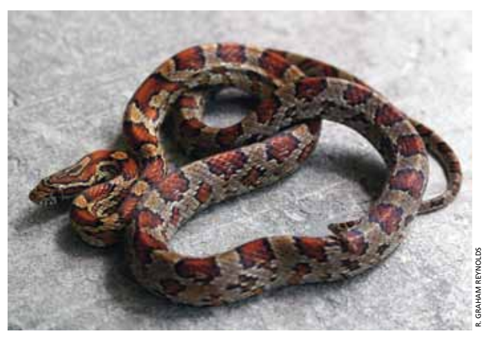
Fig. 9. Eastern Corn Snake ( Pantherophis guttatus ) captured on Grand Turk, Turks and Caicos Islands, and being held at the National Environmental Centre.

The Turks and Caicos contain a unique assemblage of native reptile species. Threats from habitat modification and direct persecution (i.e., killing snakes) are taking a toll on species such as the Turks Island Boa ( Epicrates chrysogaster ) and the Turks and Caicos Rock Iguana ( Cyclura carinata )(G. Gerber, unpubl. data; Reynolds and Gerber, in review). Threats from invasive mammalian species, such as cats, are well established, and local reptilian populations have suffered tremendously from their introduction (Iverson 1978, Mitchell et al. 2000). The degree of threat to local wildlife posed