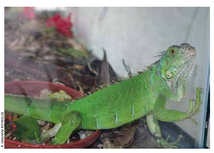
Fig. 8. Green Iguana ( Iguana iguana ) captured near Long Bay on Providenciales and being held at the National Environmental Centre.