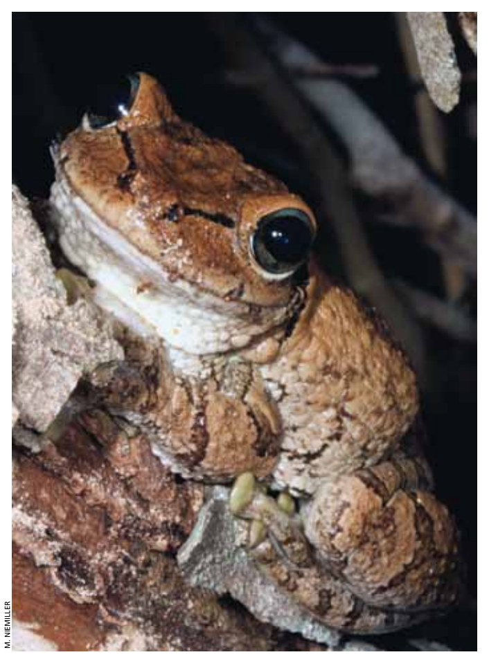
Fig. 3. Cuban Treefrog (Osteopilus septentrionalis) from North Caicos.

Cuban Treefrogs (Fig. 3) are widely introduced in the Caribbean and southeastern United States, with populations on Puerto Rico, in the Virgin Islands, upper Lesser Antilles, Florida, and elsewhere (Henderson and Powell 2009). These frogs appear able to tolerate xeric conditions that would prevent most other amphibian colonists from becoming established. As long as they have access to ephemeral or permanent sources of freshwater, these frogs can breed prolifically and become abundant. Cuban