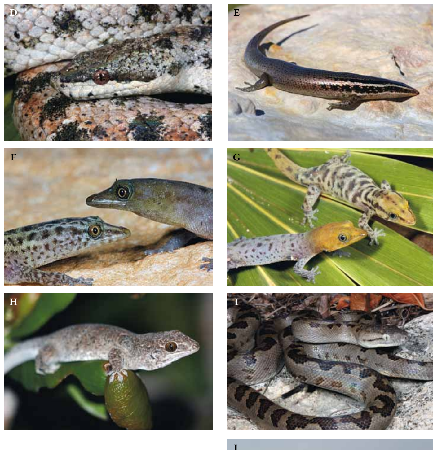
Fig. 2. Native reptiles of the Turks and Caicos: (A) Turks and Caicos Rock Iguana (Cyclura carinata), (B) Turks and Caicos Curly-tailed Lizard (Leiocephalus psammodromus), (C) Caicos Blind Snake (Typhlops platycephalus), (D) Caicos Dwarf Boa (Tropidophis greenwayi), (E) Antillean Skink (Mabuya sp.), (F) Turks Dwarf Gecko (Sphaerodactylus underwoodi; female, left; male, right), (G) Caicos Dwarf Gecko (Sphaerodactylus caicosensis, male, bottom; female, top), (H) Caicos (Hecht's) Barking Gecko (Aristelliger hechti), (I) Turks Island Boa (Epicrates chrysogaster chrysogaster), (J) Southern Bahamas Anole (Anolis scriptus scriptus).