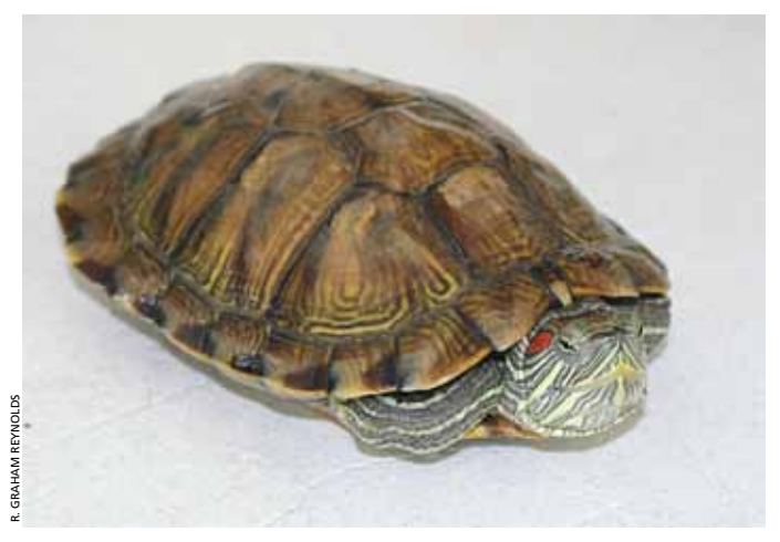
Fig. 5. Red-Eared Slider ( Trachemys scripta elegans ) captured near the Provo Golf Club on Providenciales, Turks and Caicos Islands and being held at the National Environmental Centre.