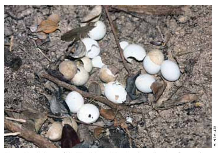
Fig. 7. Hatched nest of the Wood Slave ( Hemidactylus mabouia ) under a rock on Salt Cay, Turks and Caicos Islands.

occupying vertical surfaces of trees, rock walls, and buildings and feeding on small flying or climbing insects. Color photo vouchers, APSU 18047, 18945, 18946, and 18949.