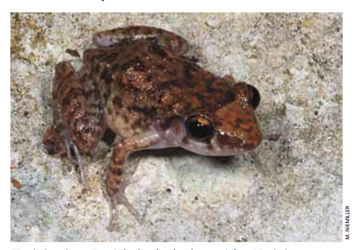
Fig. 4. Greenhouse Frog (Eleutherodactylus planirostris) from North Caicos.

Greenhouse Frogs (Fig. 4) are small terrestrial frogs that stow away in soil and plants, and have been introduced to Jamaica, Florida, and the Turks and Caicos Islands from their native range in Cuba, the Caymans, and the Bahamas (Henderson and Powell 2009). This species is a direct-developer, meaning that the larval stage is completed in the egg. Eggs are laid in moist leaf litter, and hatchlings emerge as miniature adults. Greenhouse Frogs occur in the Turks and Caicos on the islands of Providenciales, Grand Turk, North Caicos, and Middle Caicos, and will likely be discovered on other islands. Color photo voucher, APSU 19023.