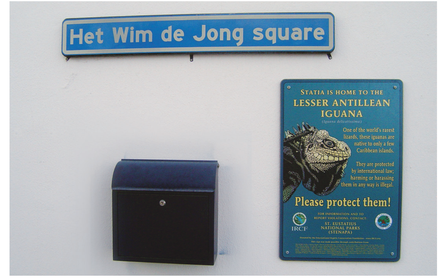
A new sign at the entrance to Dutch Plumbing Services in the business district.