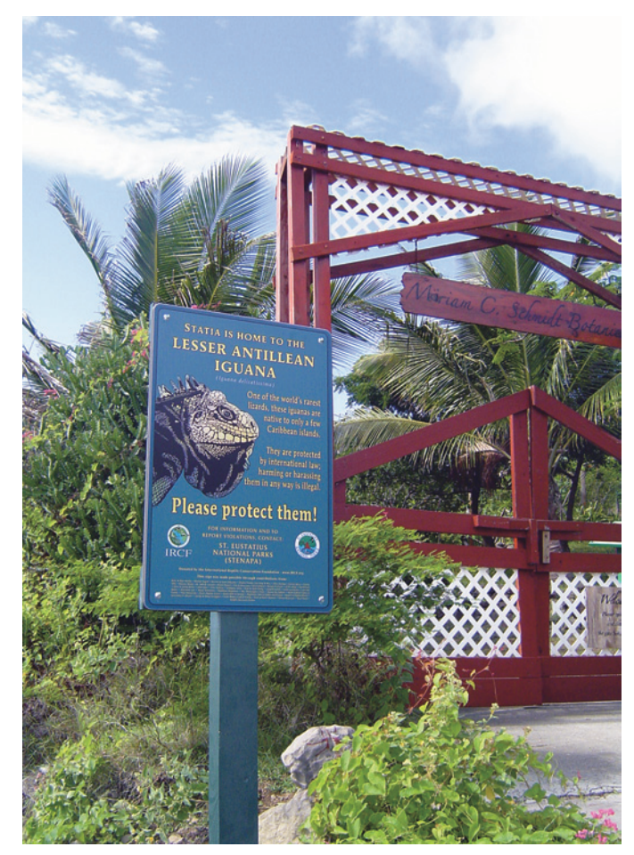
Another one of the new iguana signs at the entrance of the Miriam C. Schmidt Botanical Garden.

<section-header><image><image><image><image><image><text><text><text><text>