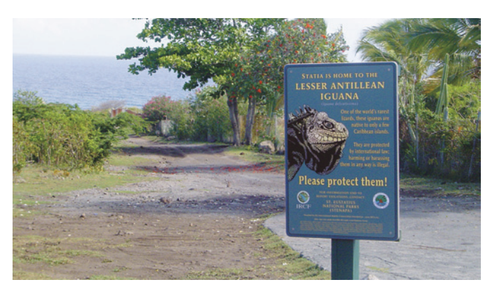
Signs have been placed strategically all over the island; this one is near the Lynch Plantation School.

Fundraising efforts by IRCF members in the United States managed to raise sufficient funds to not only replace the signs, but to improve on their quality. Additionally, the IRCF sent T-shirts that were presented to the Commissioner for Environment, all five Tourism Office staff, the nine members of the STENAPA board, and eight staff members. The Nustar Statia Oil Terminal provided