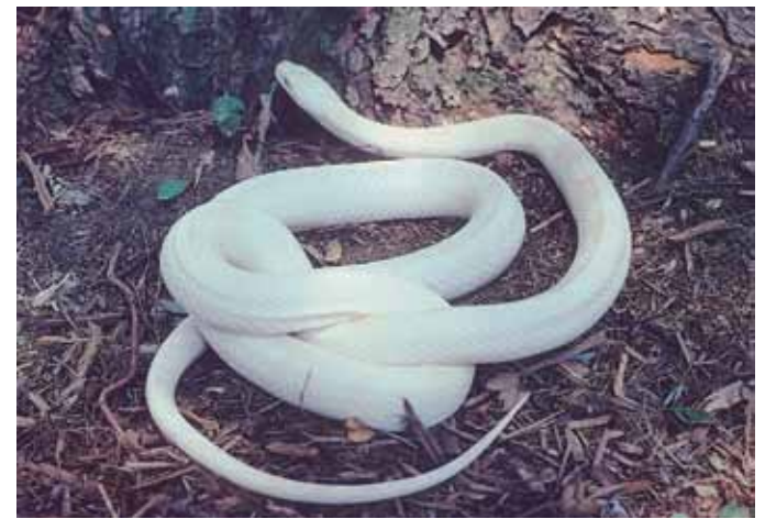
A captive-bred amelanistic Black Rat Snake ( Pantherophis obsoleta ) would almost certainly fall victim to a predator in nature.

The dictionary tells us that a "tame" animal is, "reduced from a state of native wildness, esp. so as to be tractable and useful to man." Tameness, then, is a quality of an individual animal. However, I would suggest that many herps not only have the ability to become "tame" (useful as a pet), but some actually come under the label of "domestic." Most definitions of domestic involve qualities such as having an animal's breeding controlled