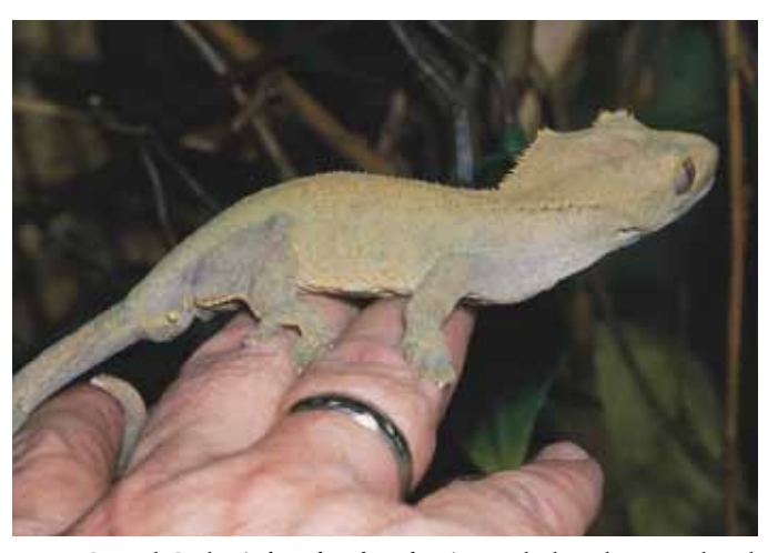
Many Crested Gecko ( Rhacodactylus ciliaris ) morphs have been produced by selective captive breeding.