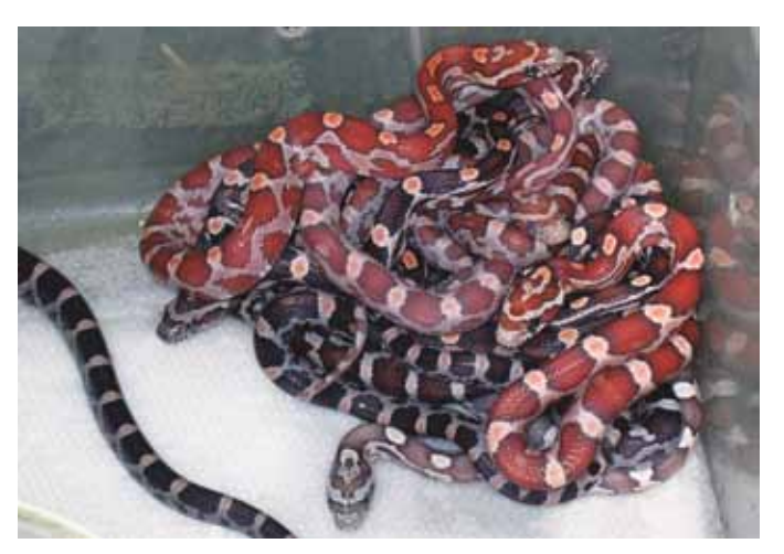
This mixed clutch of Corn Snakes ( Pantherophis guttatus ) provides a glimpse of the available color patterns that include normal, ghost, hypomelanistic, and anerythristic color morphs.

Although many other species might be nominated as "domestic" (see the list at the beginning of this article), the above four (Corn Snake, Leopard Gecko, Bearded Dragon, and Crested