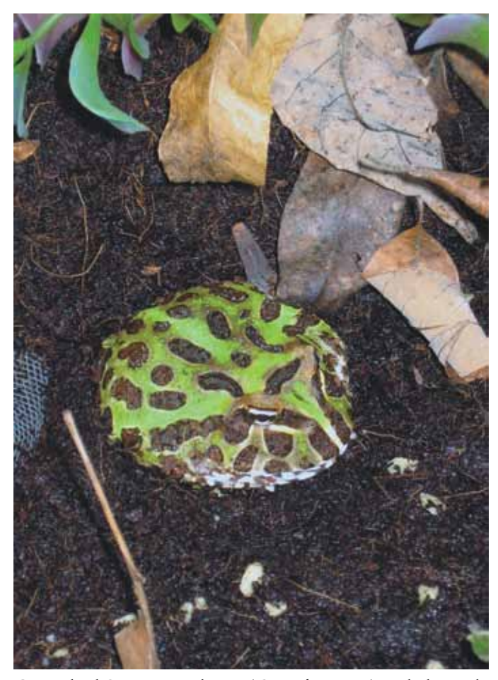
Captive-bred Ornate Horned Frogs (Ceratophrys ornata) speak eloquently to the fact that reptiles are not the only "domesticated" herps.

The next domestic herp candidate is the Crested Gecko. Described in 1866 and presumed extinct prior to the early 1990s, the Crested Gecko is certainly bred by the thousands annually in the U.S. Similar to the three above-mentioned creatures, online forums and breeders of this lizard are numerous. Formulated diets that are