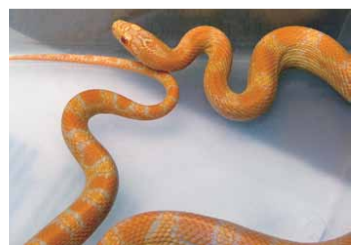
Captive breeding can generate hybrids that combine pattern elements of two different partental species. This is a captive-bred hybrid Corn Snake and California King Snake (Lampropeltis getula californiae); both parents were albinos.

Bearded Dragons are another "domestic" breed. They seem more prevalent at some herp shows in the Midwestern United States than even Corn Snakes or Leopard Geckos. Surely thousands of these are bred annually. In the U.S., the initial breeding work was done in the late 1980s, perhaps 20 years ago. Bearded Dragons are naturally rather phlegmatic and handleable as adults. At least seven distinct color forms are mentioned in a popular care manual, and breeders are constantly creating and naming new ones. As with Leopard Geckos, commercially formulated artificial foods are available, although supplementation with insects and other vegetation often is recommended.