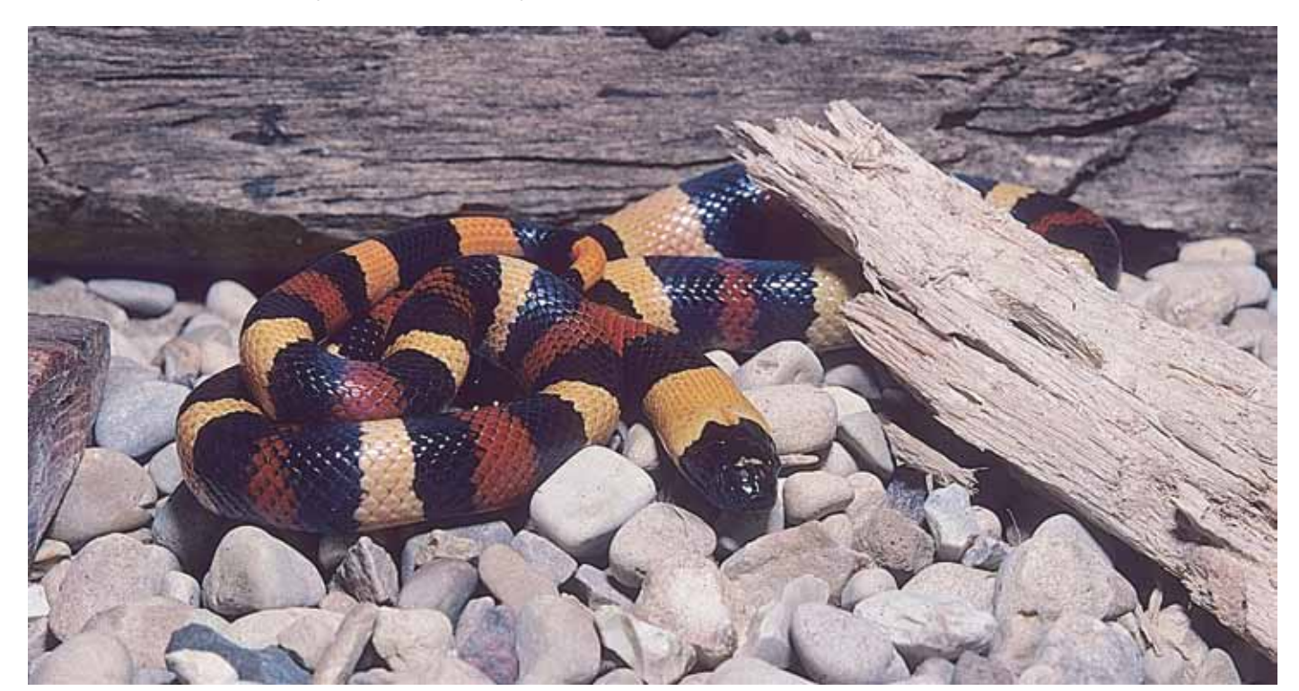
A captive-bred "apricot morph" of the Pueblan Milk Snake (Lampropeltis triangulum campbelli).

by humans, having a human-desired purpose for the breeding, and having changes take place in the species so that it is no longer