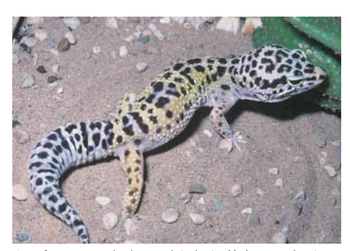
One of many captive-bred Leopard Gecko ( Eublepharis macularius ) patterns; albinos, orange forms, and leucistics also are available.

What about reptiles? Consider that Crested Geckos ( Rhacodactylus ciliaris ) were being bred in captivity in fairly large numbers by 1993. Ball Pythons ( Python regius ) have been commonly captive-bred for close to 15 years, and Corn Snakes ( Pantherophis guttatus ) have been bred in captivity for more than 30 (I communicated with zoos in the early 1970s about the best way to breed Corn Snakes). Much of this breeding was done with amateur herpetoculturists in mind, making animals that fed better, bred better, were "prettier," and were more "handleable." Animals that would survive captive rearing were the ones with the simplest requirements and the most flexible habits.