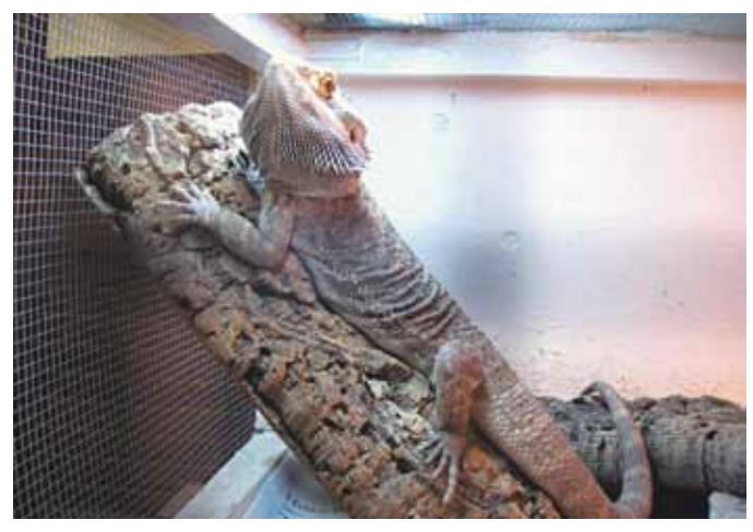
Tens of thousands of Bearded Dragons (Pogona vitticeps) are bred annually and the species has been selectively bred in captivity since the late 1980s; at least seven distinct color forms are mentioned in one popular care manual.

Many herps have fairly long generation times for small animals, breeding at 2 or more years of age. This means that 30 years (time since Corn Snakes have been captive bred) would give us time for 15 generations to be "selected" by captive breeding. Some of the smaller lizards like Crested Geckos (Rhacodactylus ciliaris) can breed at one year of age, allowing more generations in less time, so quicker selection by breeders. Let's look at some of the prime herp candidates for domestic classification. Corn Snakes are my nominee for number one. They have been bred for decades and occur in at least 30 different color and pattern morphs. Tens of thousands are bred annually for the pet trade, and every pet shop that handles herps has or can get Corn Snakes. All ages tend to feed well on domestic mice. Most individuals are handleable, and skin shedding takes place with few problems. Corns can be easily raised and bred in very simple habitats with a substrate, heat source, hide box, and water dish. Several of the color phases are showy enough that they would probably be lost to predation in the wild. Hundreds of hatchling Corn Snakes may be seen at any decently sized herp expo.