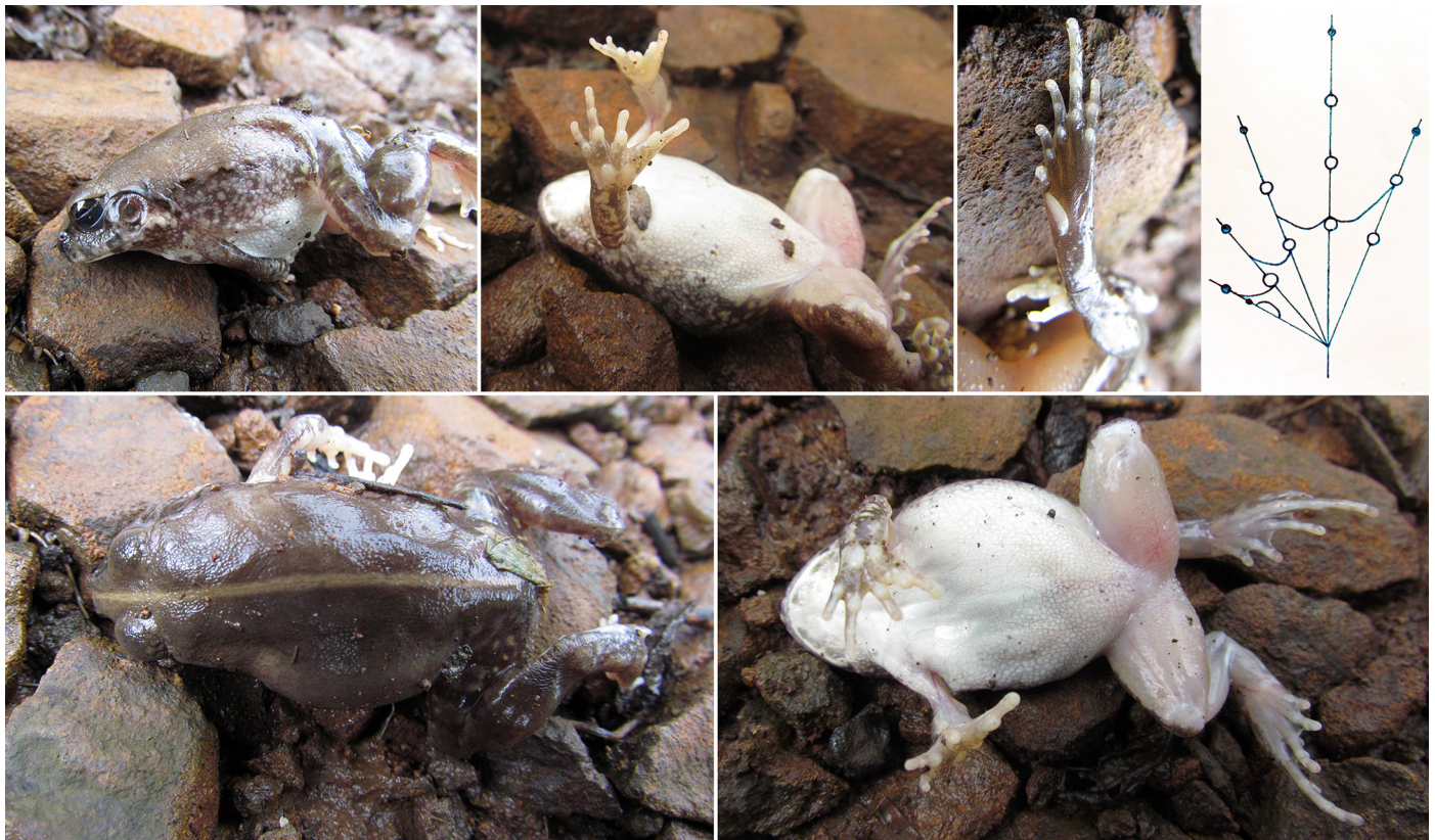
Fig. 2. A Road-killed Dobson's Burrowing Frog ( Sphaerotheca dobsonii ) from The Dangs District, Gujarat, India. Note relative finger lengths (top center) and the metatarsal tubercle and extent of webbing on the toes (upper right). drawing by Vasudev Limbachiya.