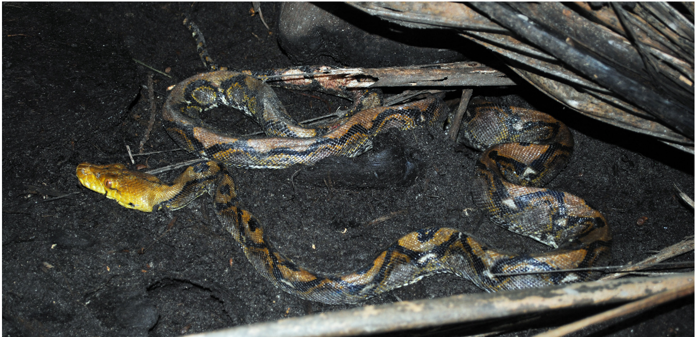
Fig. 2. The only live Reticulated Python ( Malayopython reticulatus ) encountered during this study was from Menchal Island.