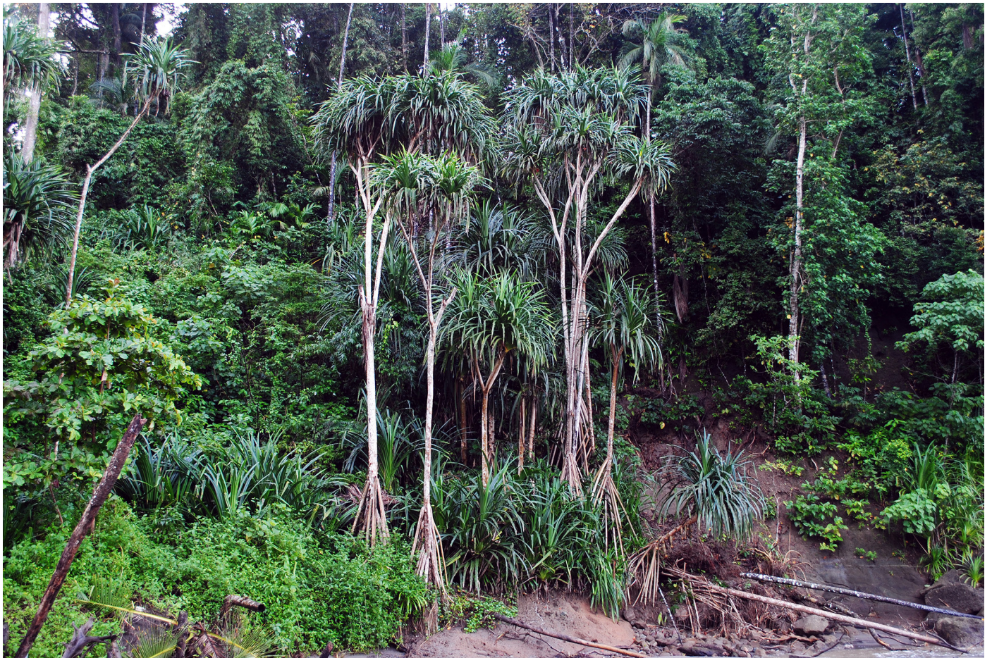
Fig. 3. Reticulated Python ( Malayopython reticulatus ) habitat in lowland forest on Menchal Island.