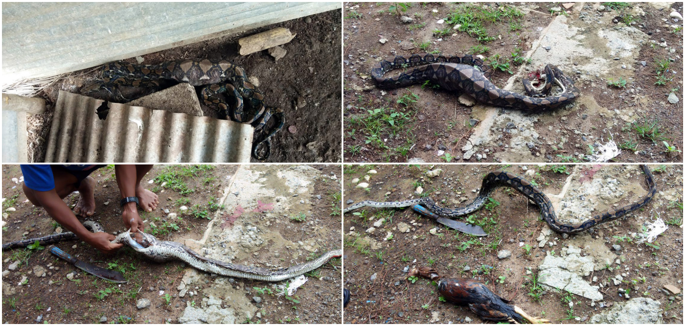
Fig. 4. Reticulated Pythons ( Malayopython reticulatus ) are culturally regarded as elements of destruction and the Nicobarese often kill snakes that can prey on domestic chickens and pigs. This python was killed after eating a domestic chicken on Kamorta Island.

ing of wild populations for the leather industry is prevalent in the Indonesian Archipelago (Shine and Harlow 1999), that trade has not yet reached the Nicobar Islands. However, Vijayakumar and David (2006) indicated that habitat destruction and persecution played major roles in pre-tsunami population declines of pythons in the archipelago — and these continue today. The recent thrust for economic development by promoting tourism and other activities (Giles 2018) on top of the ongoing clearing of forests for coconut plantations and human settlements and the unsustainable harvesting of natural resources associated with a growing human population (Saini 2013) might render the long-term survival of Reticulated Pythons in the Nicobar Archipelago untenable.