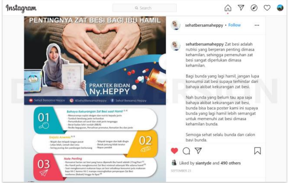
Figure 2 : Example of Educational Content about Rational Use of Supplementation in Pregnancy

Figure 2 is an example of educational content that won the competition in the evaluation stage. The use of Instagram, as a good educational medium for patients, is one of the effective education efforts for patients become new strategy accomplished by midwives.