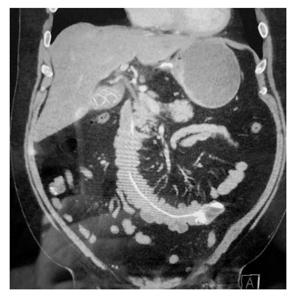
Figure 1. CT scan of the abdomen. Evidence of laparoscopic gastric band that has eroded into the stomach and is not present distally in the small bowel.