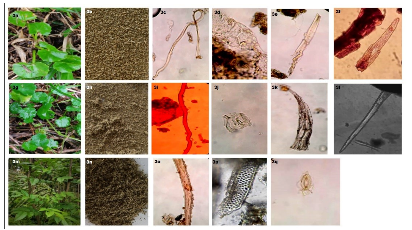
Fig. 3. Photomicrographs of microscopic evaluation (400x). 3a. Centella asiatica plant, 3b. C. asiatica whole plant powder, 3c. Fibre, 3d. Stomata, 3e. Fibre, 3f. Trichome, 3g. Hydrocotyle sibthorpioides plant, 3h. H. sibthorpioides whole plant powder, 3i. Fibre, 3j. Stomata, 3k. Trichome, 3l. Hair, 3m. Senna hirsuta plant, 3n. S. hirsuta leaf powder, 3o. Trichome, 3p. Pitted vessel, 3q. Stomata.

i.e. fibre provides mechanical support (71), was seen in all the plant samples except S. hirsuta . The trichomes or hairs are mainly responsible for providing protection against pathogens in addition to regulating temperature by reducing evaporation (72) whereas, stomata is associated with gaseous exchange (5).