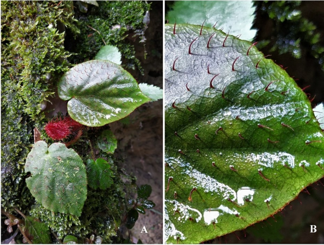
Fig. 3. Begonia limprichtii (A, B).

nate; stipules ovate, subulate, 0.9–1.3 × 0.6–0.9 cm, margin irregular with short strigose hairs, apex acuminate, outer surface puberulent, inner surface glabrous; petiole terete, red; lamina orbicular to widely ovate 5–15 × 3.5–12 cm, margin serrate, apex acute, base cordate, basal lobes overlapping or nearly so, sparsely covered with red strigose hairs, 1–2 mm long; venation palmate, veins 6–7. Inflorescences axillary with 5–9 flowers. Flowers monoecious. Staminate flower: pedicels 0.9–1.2 cm long, white; tepals 4; the outer 1.1–1.5 × 0.6–1 cm; stamens 30–50, filament ca 0.5 mm across. Pistillate flower: pedicels 0.6–1 cm long, tepals 4–5, 0.8–1.5 × 0.4–1 cm, reddish white; style bifid from middle, 0.1–0.5 cm, yellow.