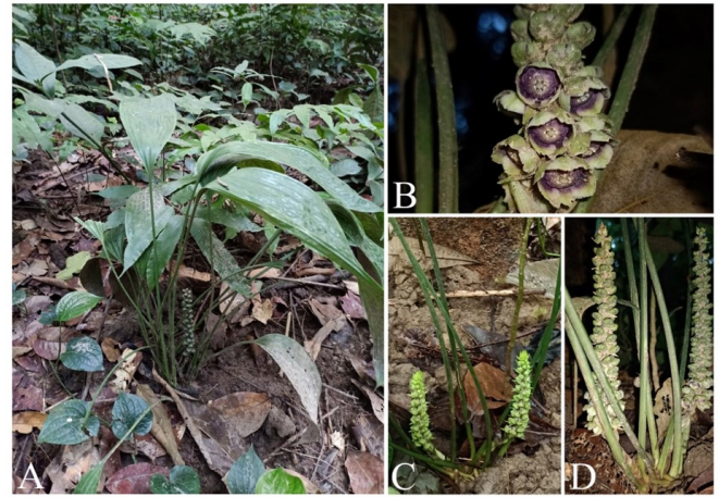
Fig. 2. Peliosanthes bipiniana A. Habitat B. Close view of inflorescence with flowers C. & D. Inflorescence in different stage. [Photo by P Mipun].

Acaulescent herbs, evergreen, perennial. Rhizome ascending to erect, subterete, branched. Roots cordlike. Leaves usually 2–3 at apex of shortly branched rhizome-like stem, basal, erect to obliquely spreading; petiole subterete, erect to suberect. Inflorescences dense-flowered, 3.5–6.5 cm long in flower. Flowers 7–33 per rachis, acrope-