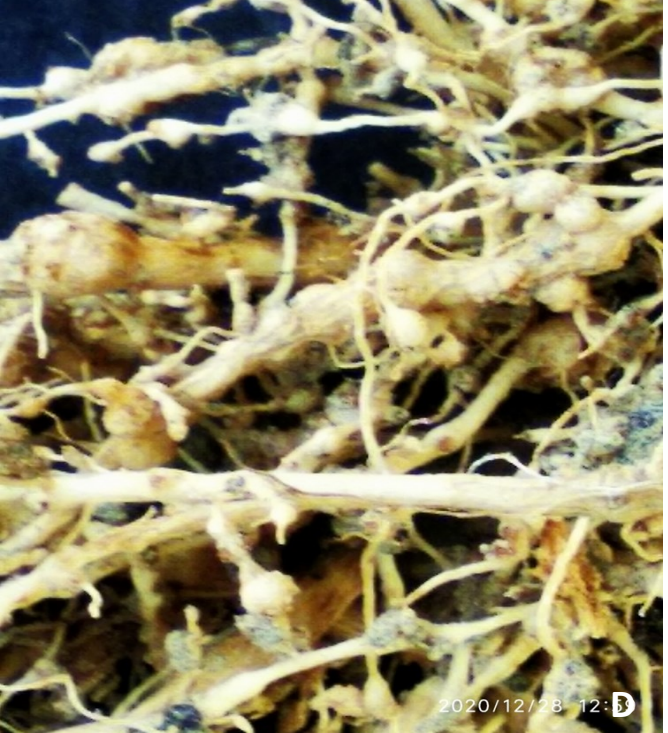
Fig. 1 (A). Above-ground symptoms (stunting, dwarfing and yellowing of leaves). (B). Egg masses of the root-knot nematode with galls on severely infected roots of eggplant. (C). Hand-picked egg masses collected in a petri dish. (D). Galls on roots of eggplant.