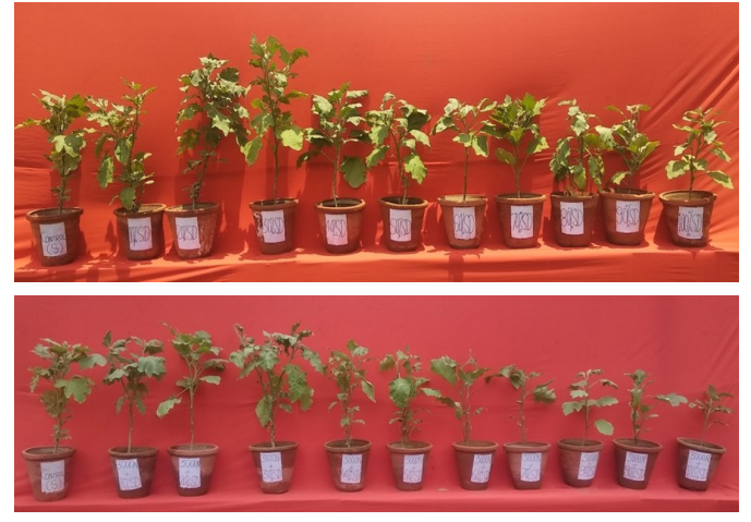
Fig. 2(A). Effect of different concentrations (T_1,T_2,T_3,T_4,T_5,T_6,T_7,T_8,T_9,T_{10}) of NSD on eggplant growth. 2(B). Effect of different concentration of NSD and root-knot nematode with 3000 inoculum level on eggplant growth.

(Table 1). The concentrations of sulphate, carbonate, bicar- Decomposed NSD, above a concentration of 30%, was bonate, and chloride in all NSD amendments were also shown to be harmful to eggplant growth and photosynthetmeasured in different mixtures. Their enhancement was ic pigments even in presence of different nematode inocu-