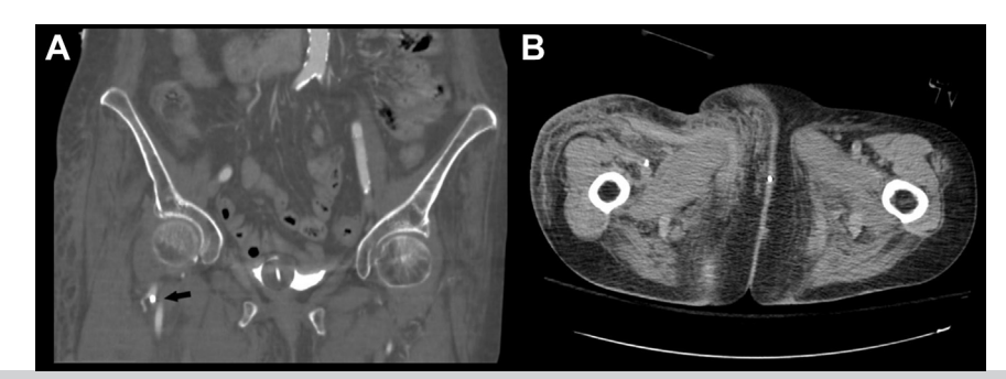
Fig 2. A,B, Views of computed tomography angiogram of the maldeployed Celt arterial closure device (ACD) in the distal profunda femoral artery.

of the Celt device from the DFA was not recommended because of her poor cardiac and overall medical condition.