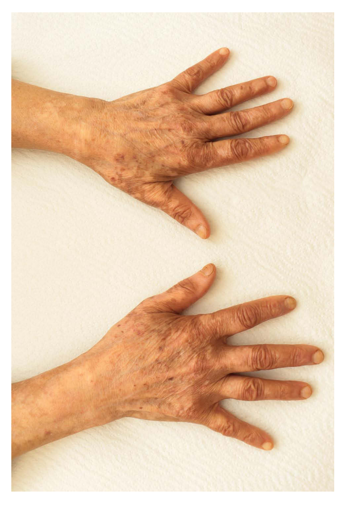
Figure 1 Well-demarcated, hypopigmented lesions over the hands with expanding patches reaching up to the forearms.